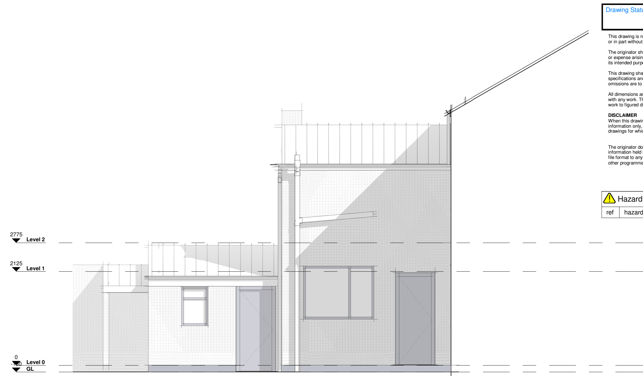
2 1104_Existing Side Elevation 1 : 50