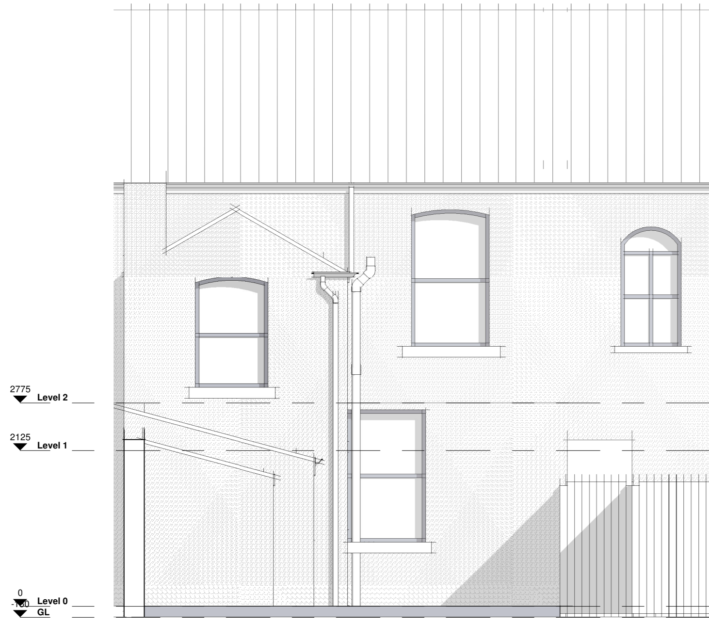
1 1103_Existing Rear Elevation 1 : 50