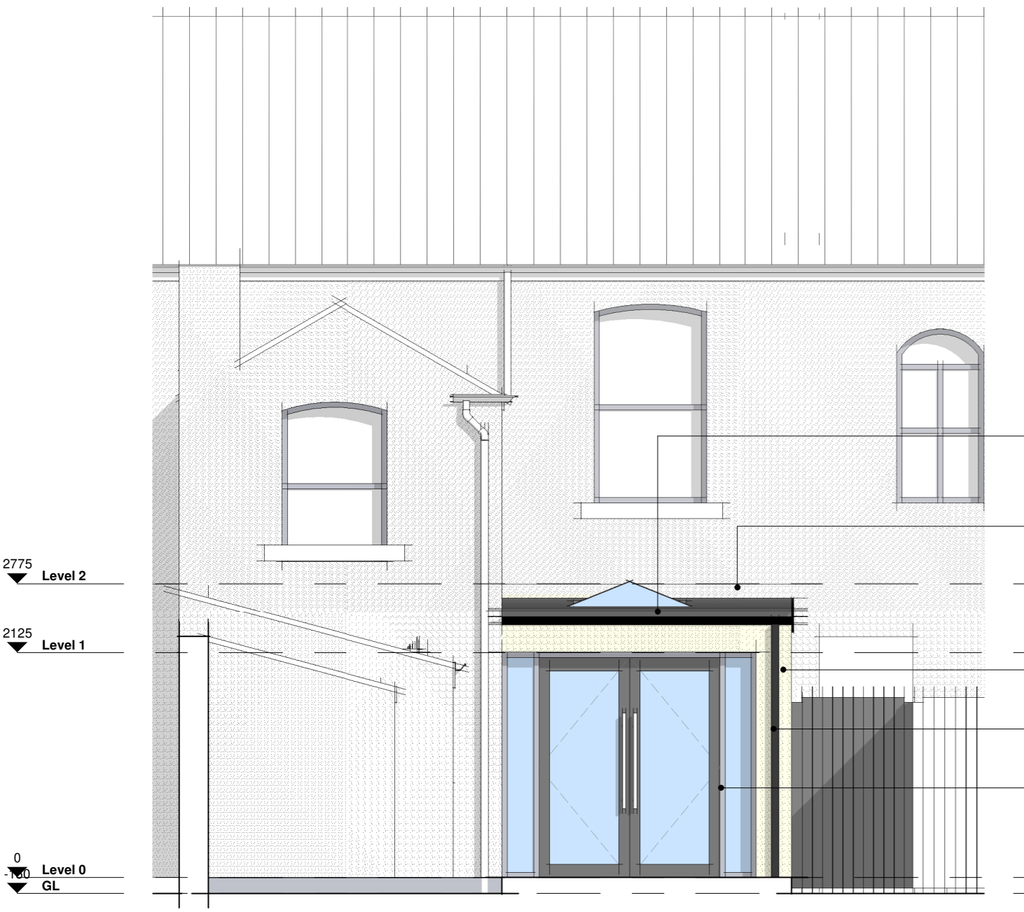
3 1107_Proposed Rear Elevation 1 : 50