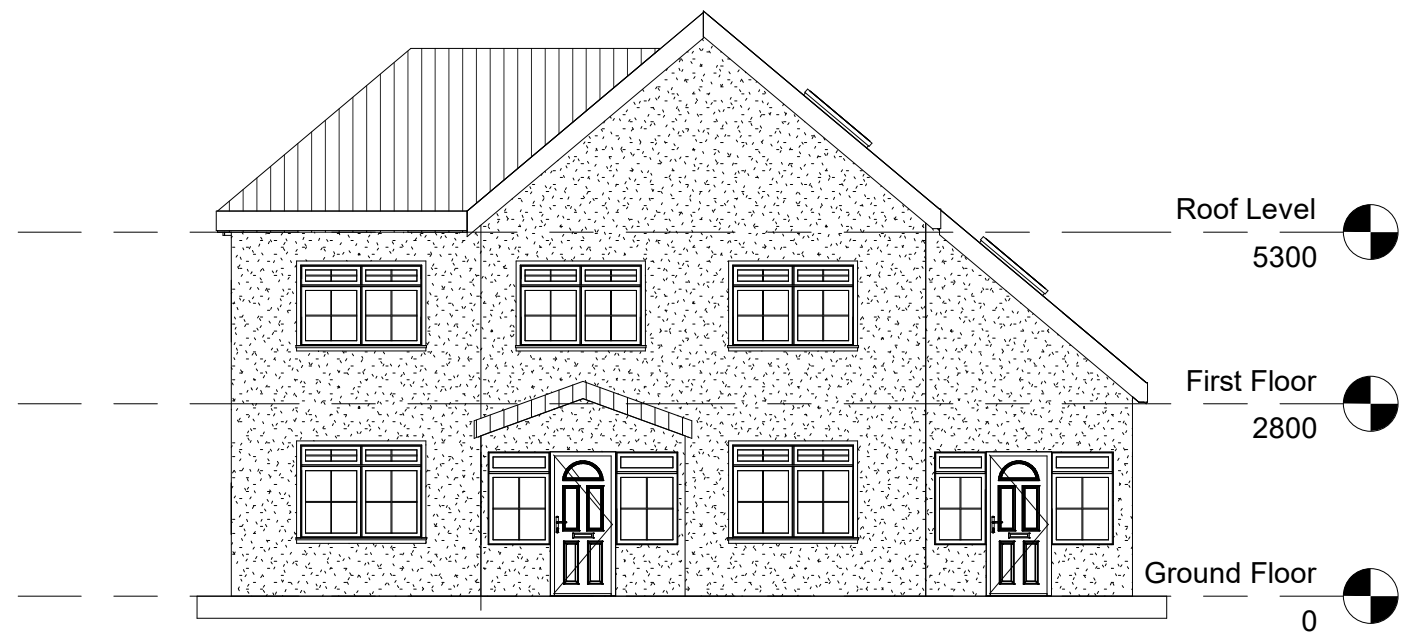
3 Proposed South Elevation 1 : 100