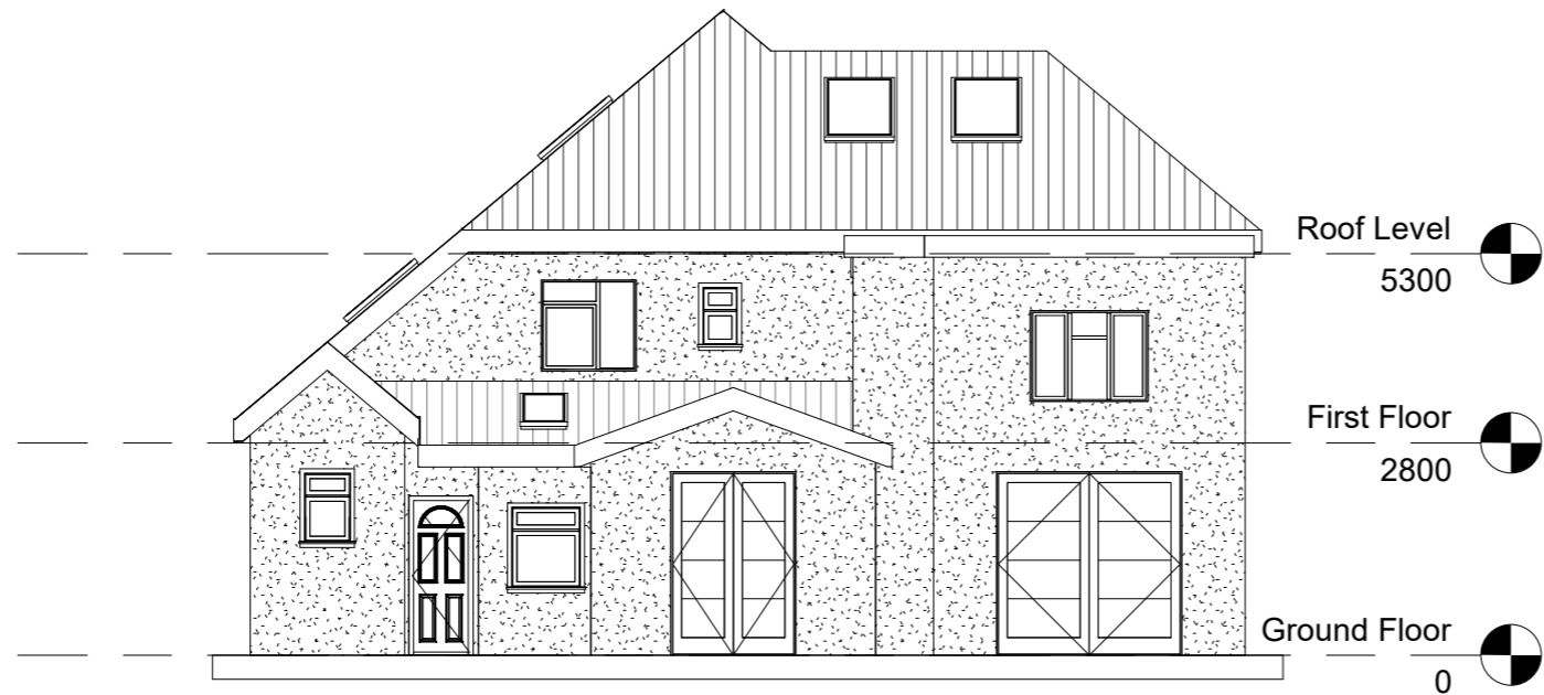
1 Proposed North Elevation 1 : 100