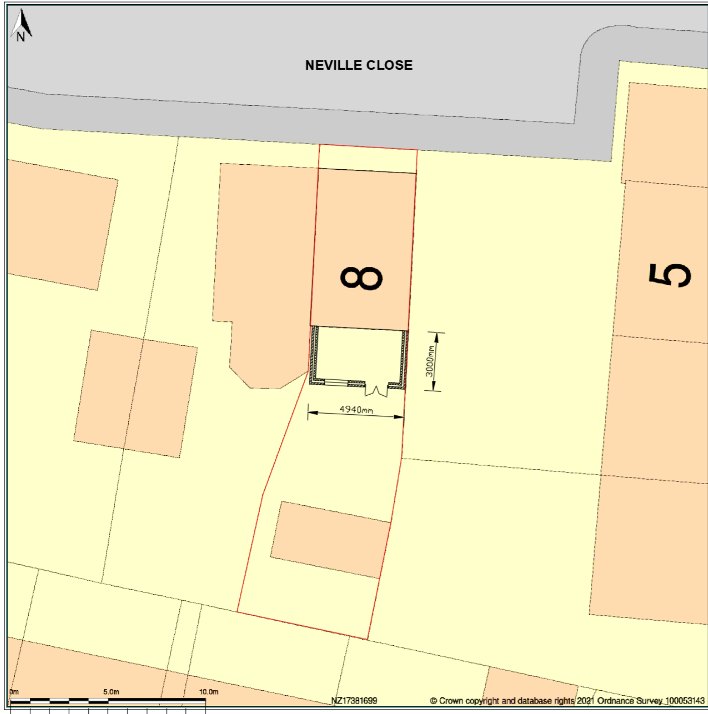
Proposed site plan Scale 1:200 metres

Drawings by ROSCAMP CONSTRUCTION Andrew Roscamp 01325 481468 07802 435157