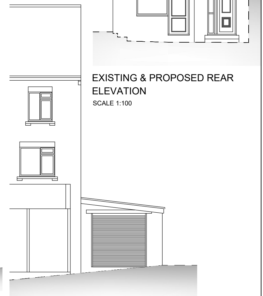
EXISTING & PROPOSED REAR ELEVATION SCALE 1:100