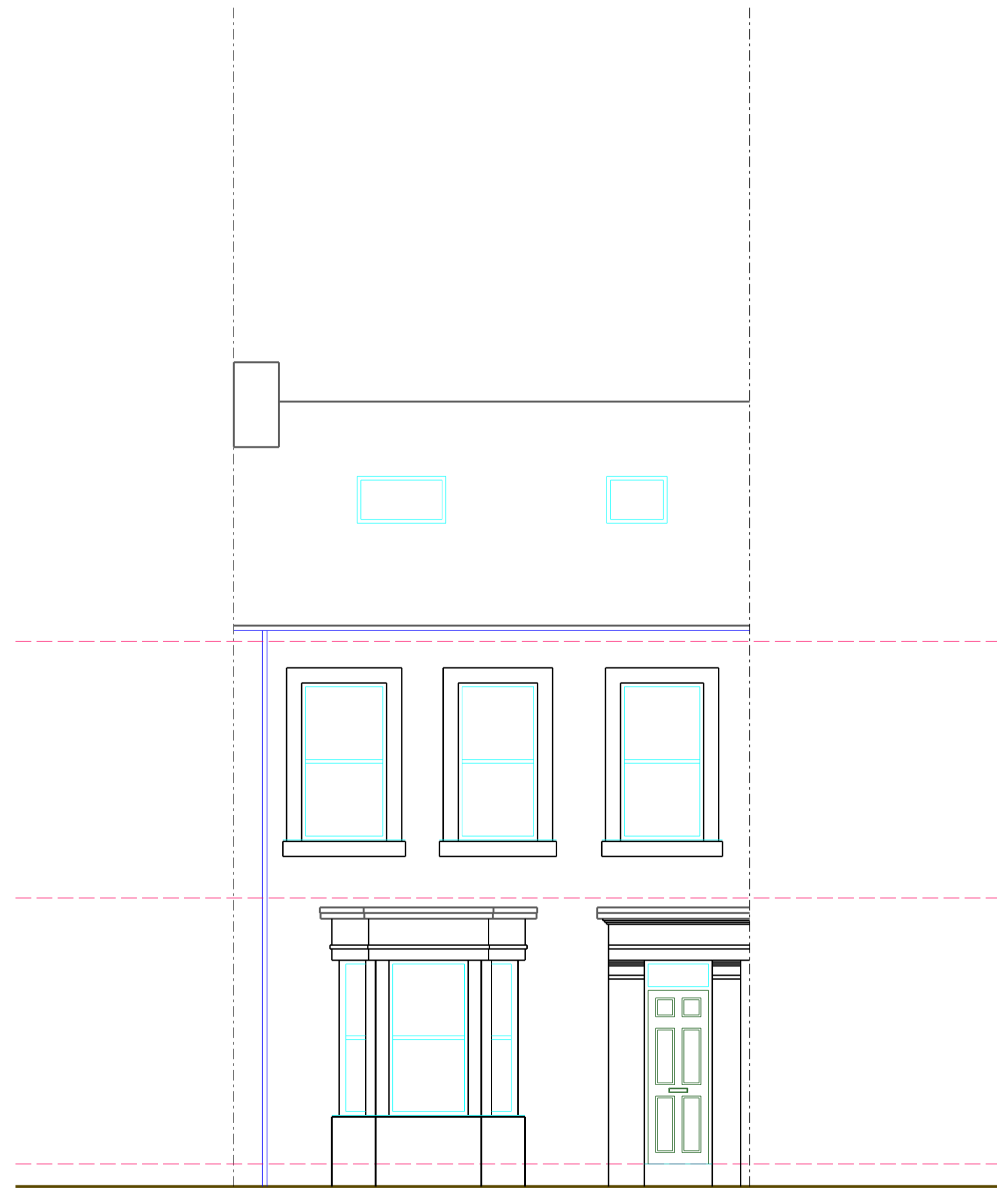
EXISTING FRONT (NORTH WEST) ELEVATION