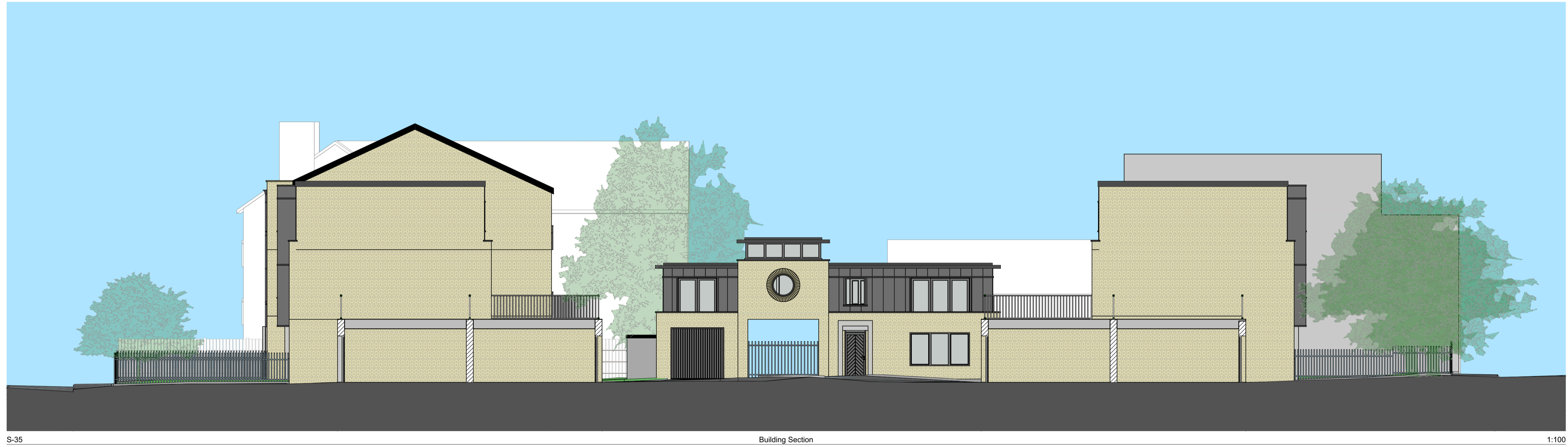
S-35 Building Section 1:100