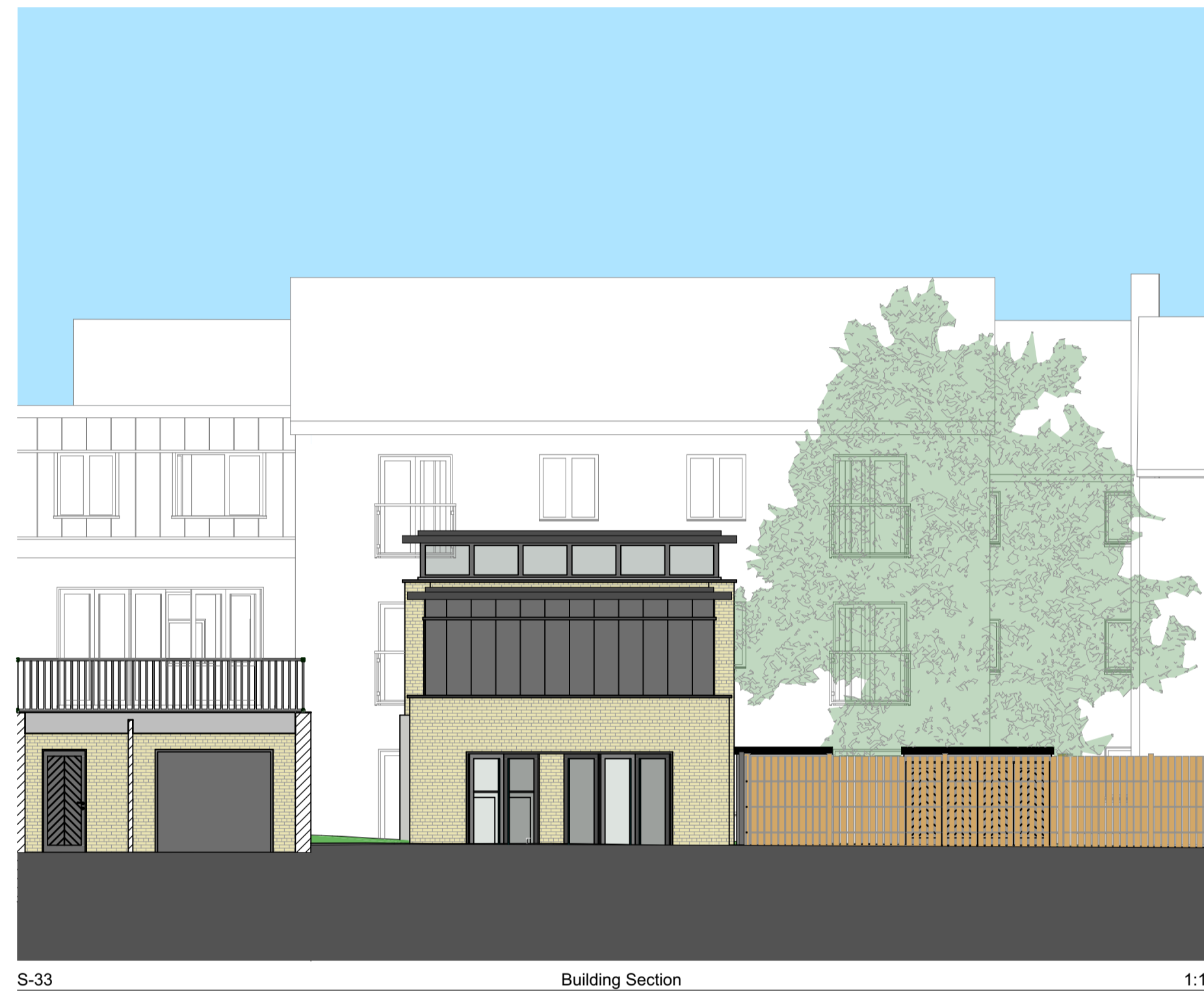
S-33 Building Section 1:100