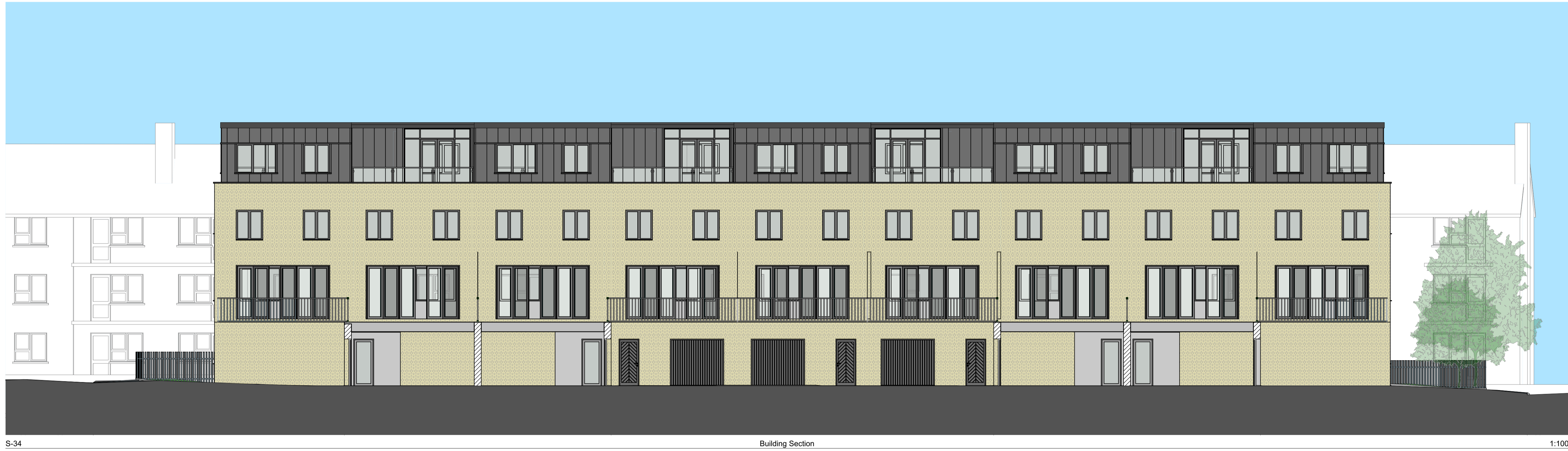
S-34 Building Section 1:100