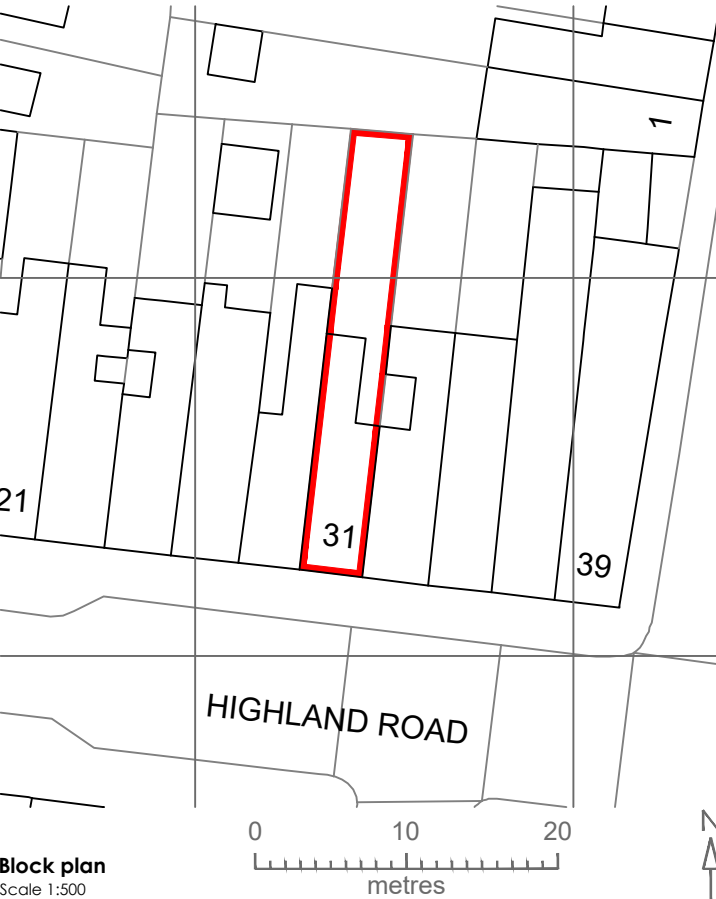
Block plan Scale 1:500

Notes This drawing is the copyright of ATP Design Ltd. and is not to be reproduced without prior written consent. Use given dimensions over scaling, do not scale from this drawing unless for planning purposes.