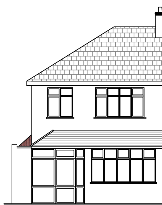
FRONT ELEVATION - no change