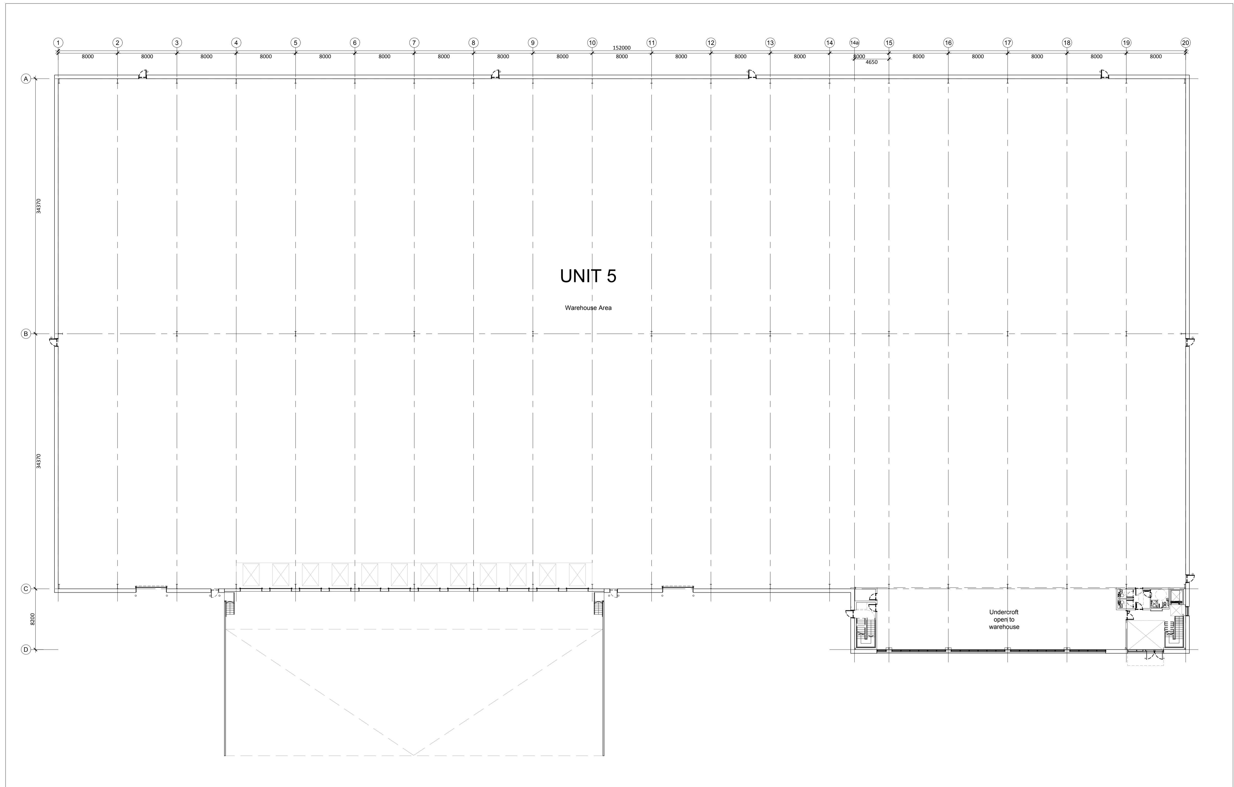
01 Unit 5 Ground Floor GA Plan 1:250 @ A1