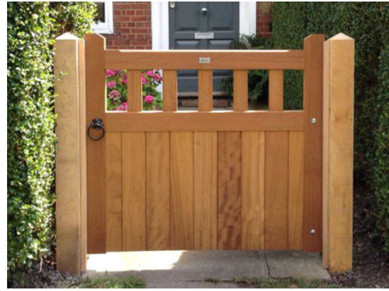
Proposed Side Gate Above image representative of gate appearance. New hardwood side gate to be oak, 1200mm high.