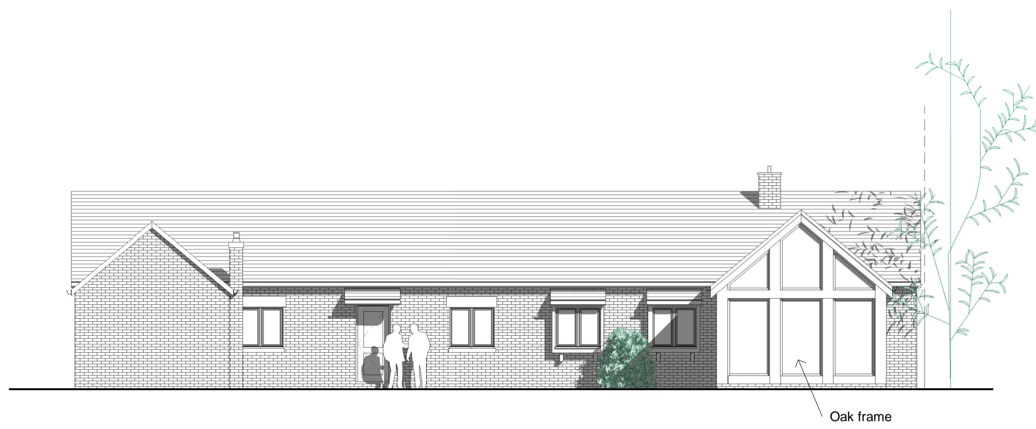
2 South Elevation 1 : 100

It is assumed that all works on this drawing will be carried out by a competent contractor working, where appropriate, to an approved method statement.