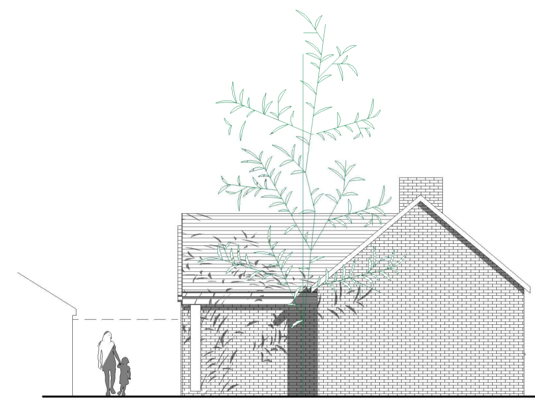
3 East Elevation 1 : 100