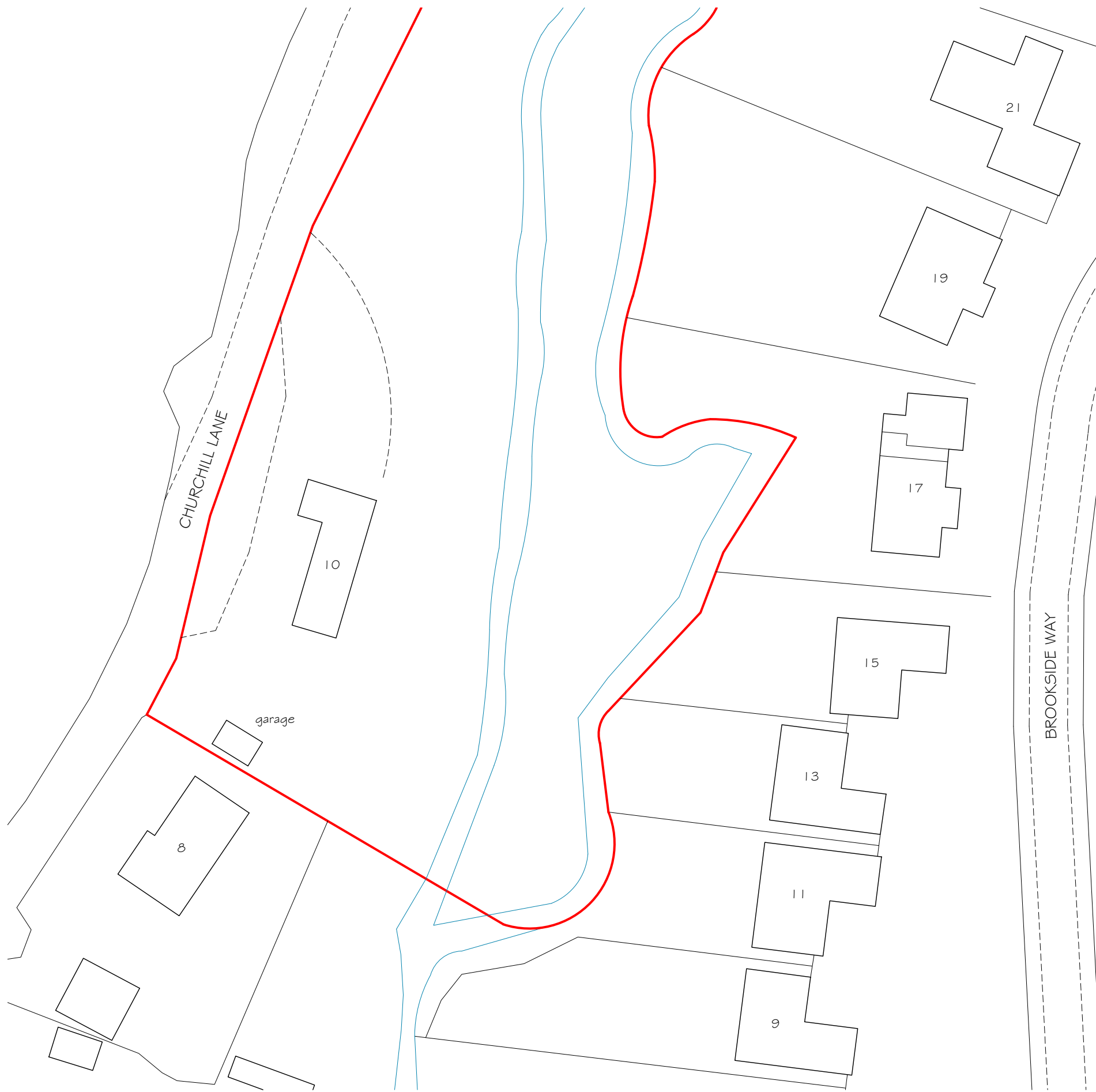
1:500 scale PROPOSED SITE LAYOUT PLAN