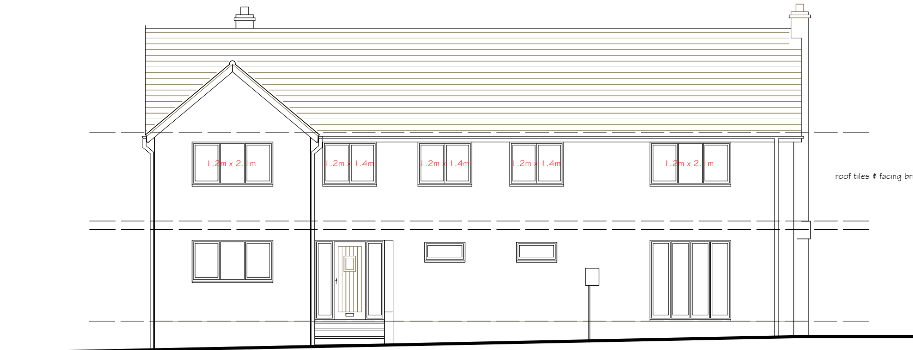
PROPOSED FRONT - WEST ELEVATION