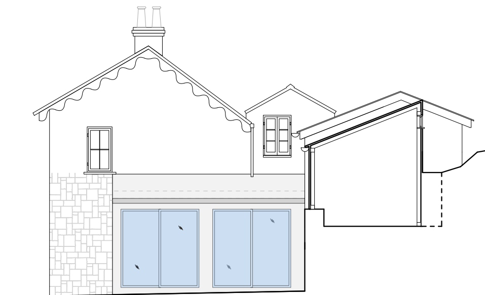
EXISTING SECTION AA