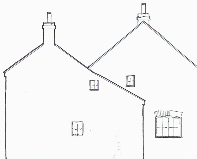
existing east elevation