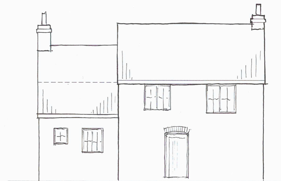
existing north elevation