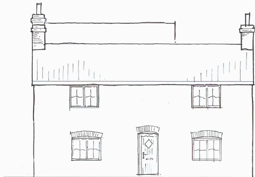
existing south elevation