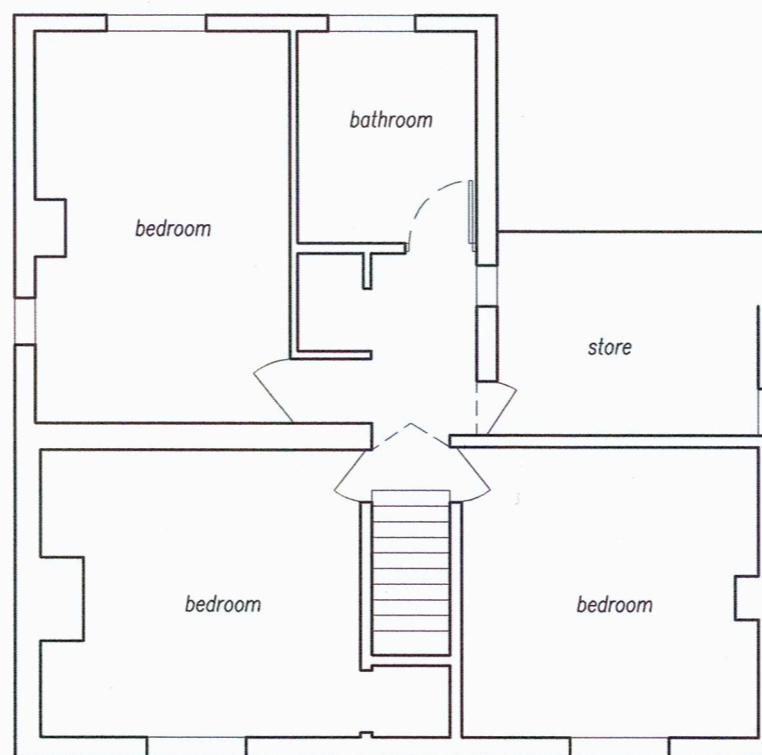
existing ground floor plan