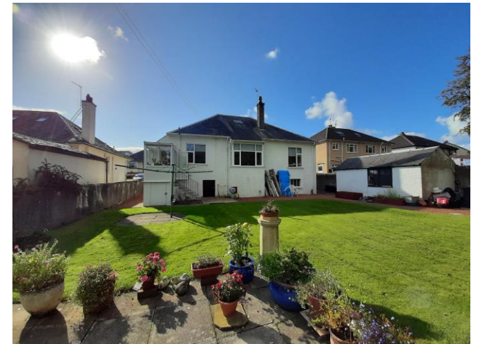
Rear View 02