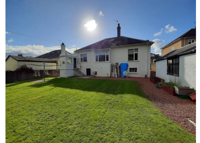
Rear View 01

In conclusion we would hope the proposals show our clients intention to sensitively refurbish and enhance their property with the simple addition of dormer windows will find Planning support and we shall look forward to working with you moving forward.