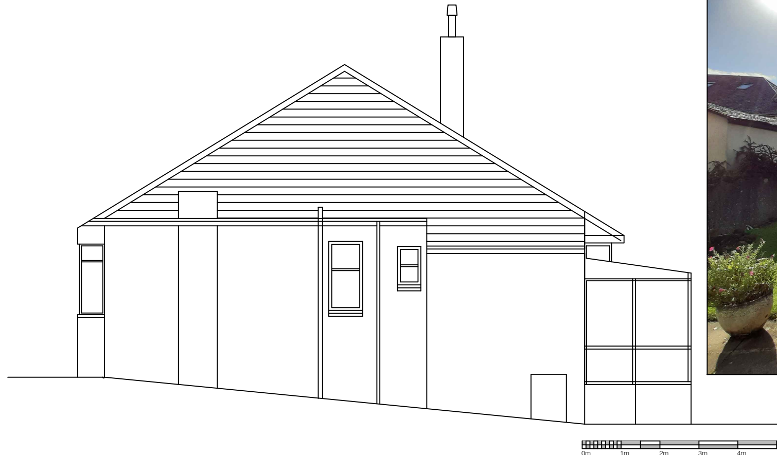
PL 0 002 Existing Side/South East Elevation Scale 1:100