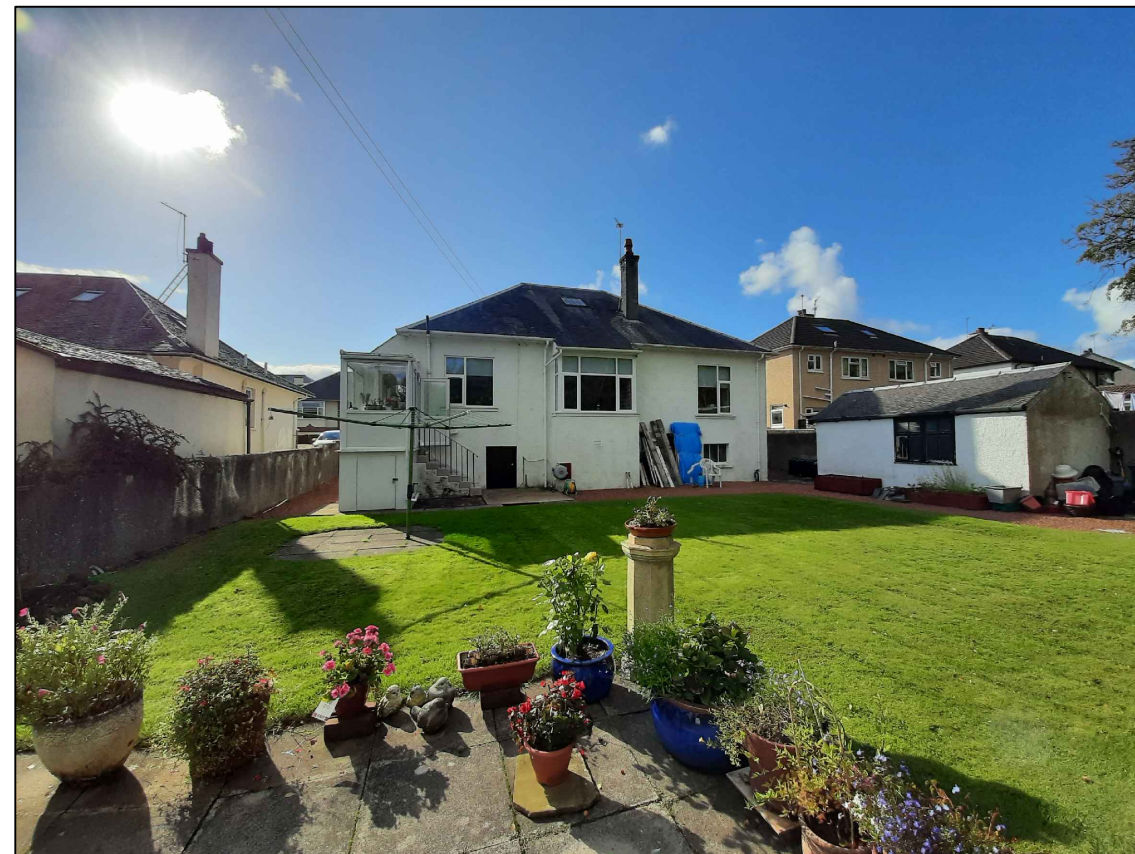
PL 0 002 View to Rear Elevation nts

Existing Materials Roof - Grey Slate Walls - White Render Windows & Doors - White Upvc Rainwater Goods - White