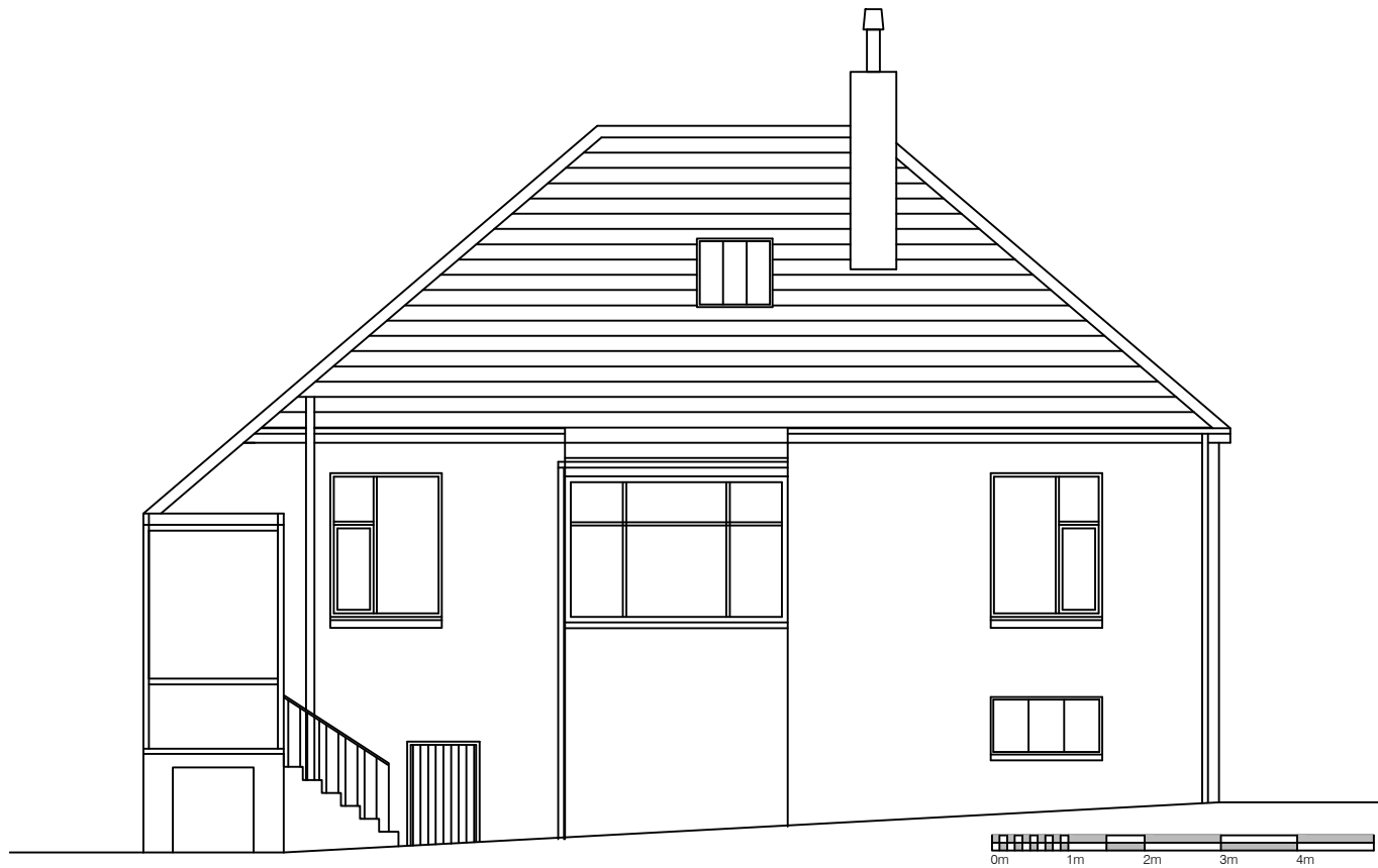
PL 0 002 Existing Rear/North East Elevation Scale 1:100