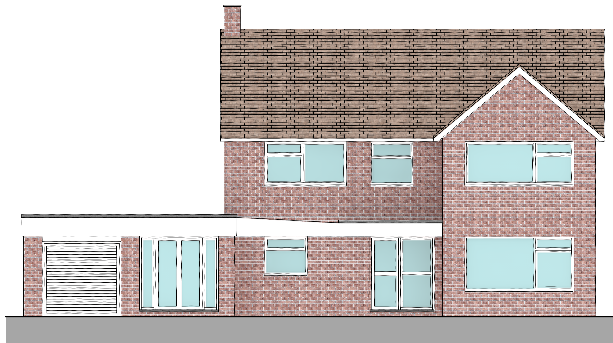
Front West Elevation

© Smart Architecture Ltd. Copyrights reserved. Use figure dimensions only. Do not scale from this drawing. All levels and dimensions to be checked on site by contractor. Any discrepancy to be verified by the Architect before proceeding. Drawing to be read in conjunction with all relevant SA drawings and specification clauses. The Contractor and relevant fabricated products to be built to current British and European Standards. This drawing must not be used for Land Transfer unless stated as 'Conveyance'. This drawing and its subject matter are the confidential property of Smart Architecture Ltd and shall not be copied, reproduced, used or disclosed to others without the prior written authority of Smart Architecture Ltd.