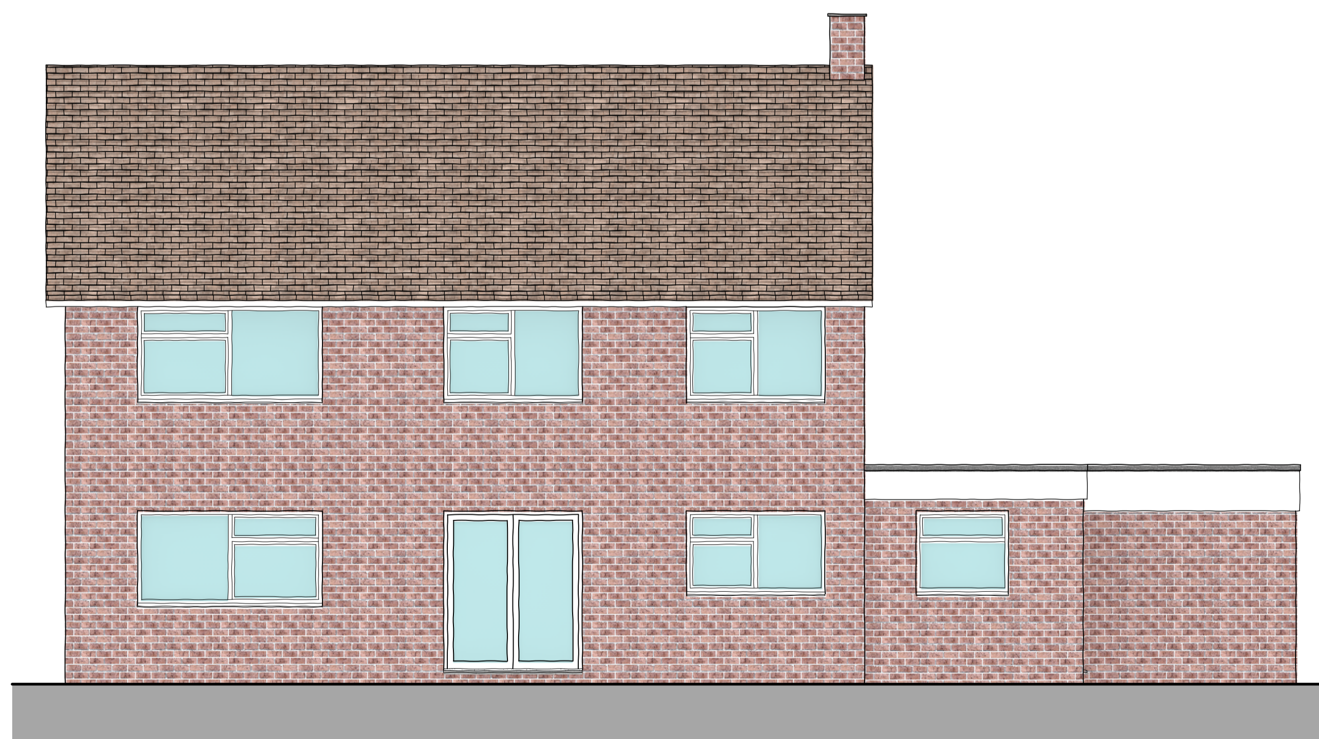
Garden East Elevation