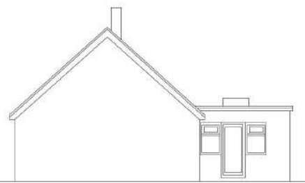
EXISTING REAR ELEVATION- SOUTHERN 1:50