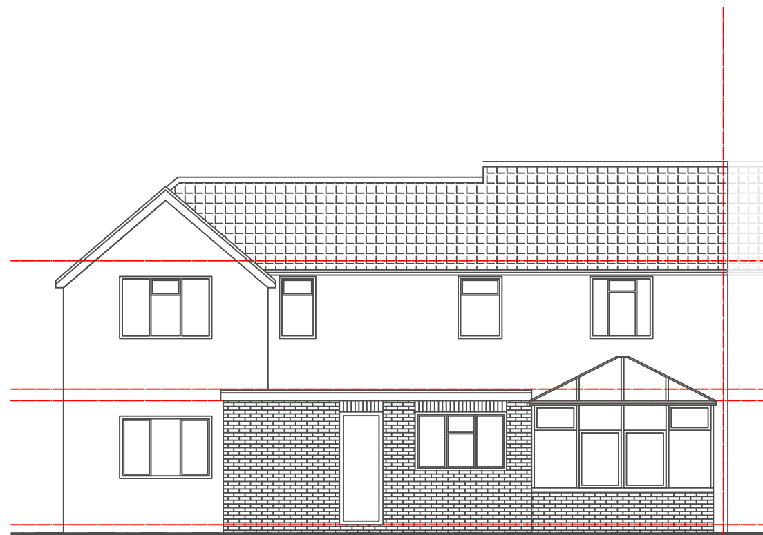
Proposed Rear Elevation Scale 1:100