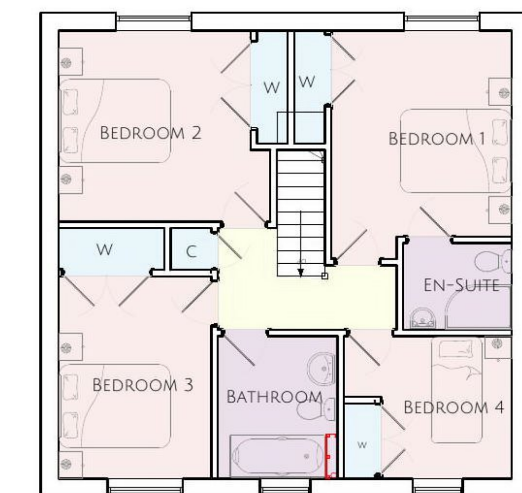
PROPOSED FIRST FLOOR 1:100