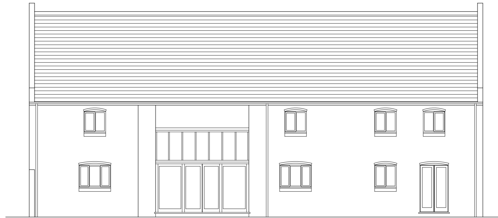
Existing Rear Elevation Scale 1/100