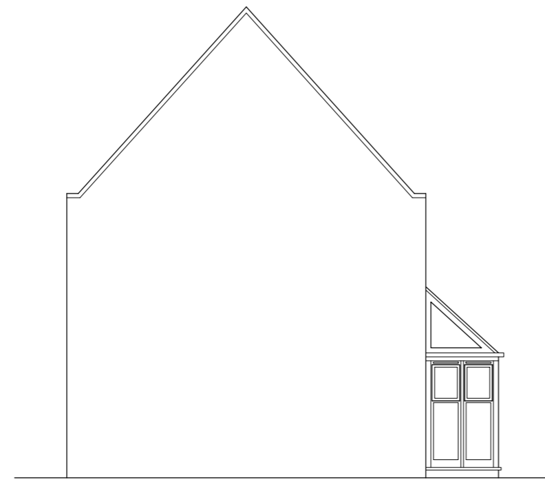
Existing Side Elevation Scale 1/100