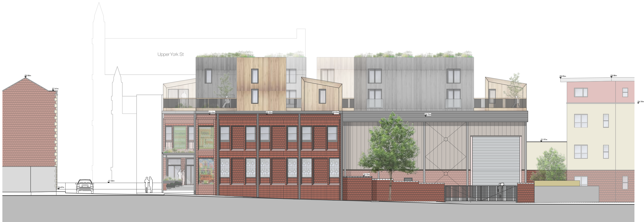
Backfields (SE) Elevation