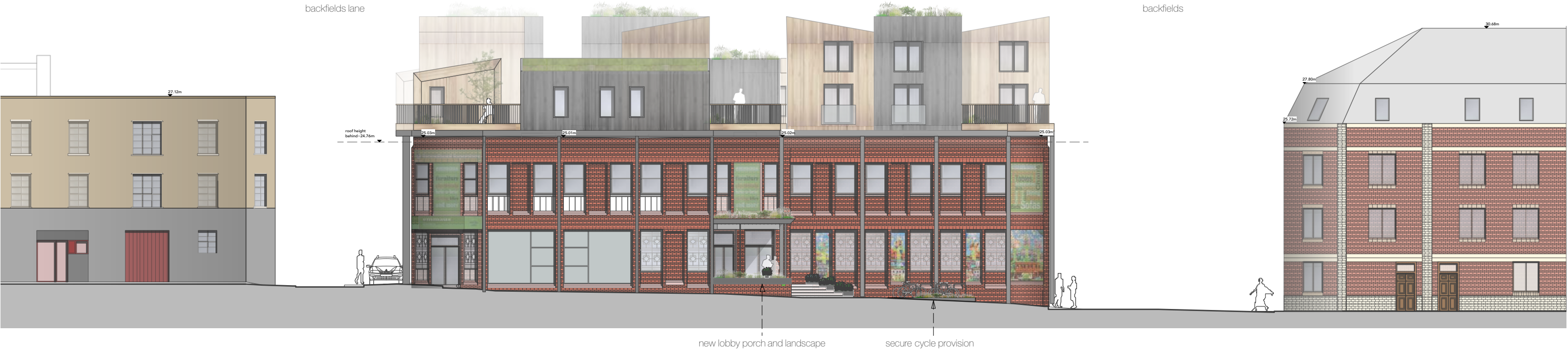
Upper York Street (SW) Elevation