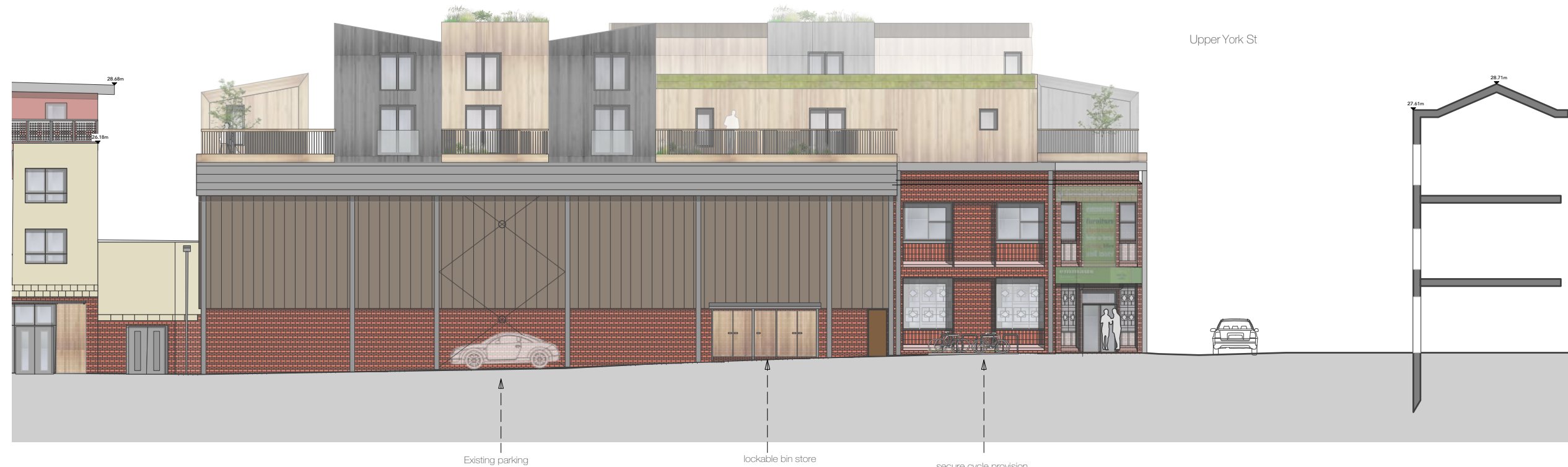
Backfields Lane (NW) Elevation