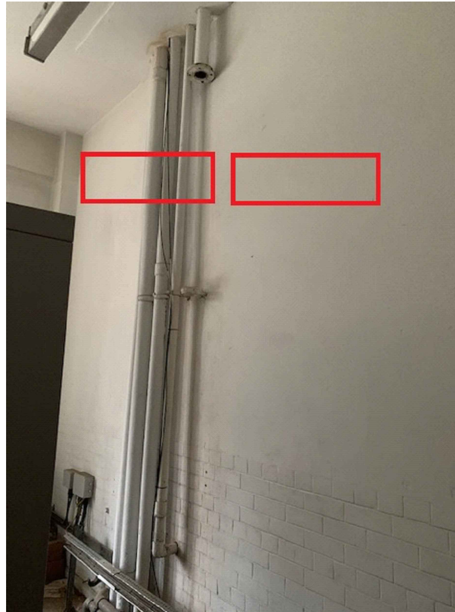
PROPOSED INTERNAL VIEW SHOWING AIRCON EVAPORATOR UNITS POSITION