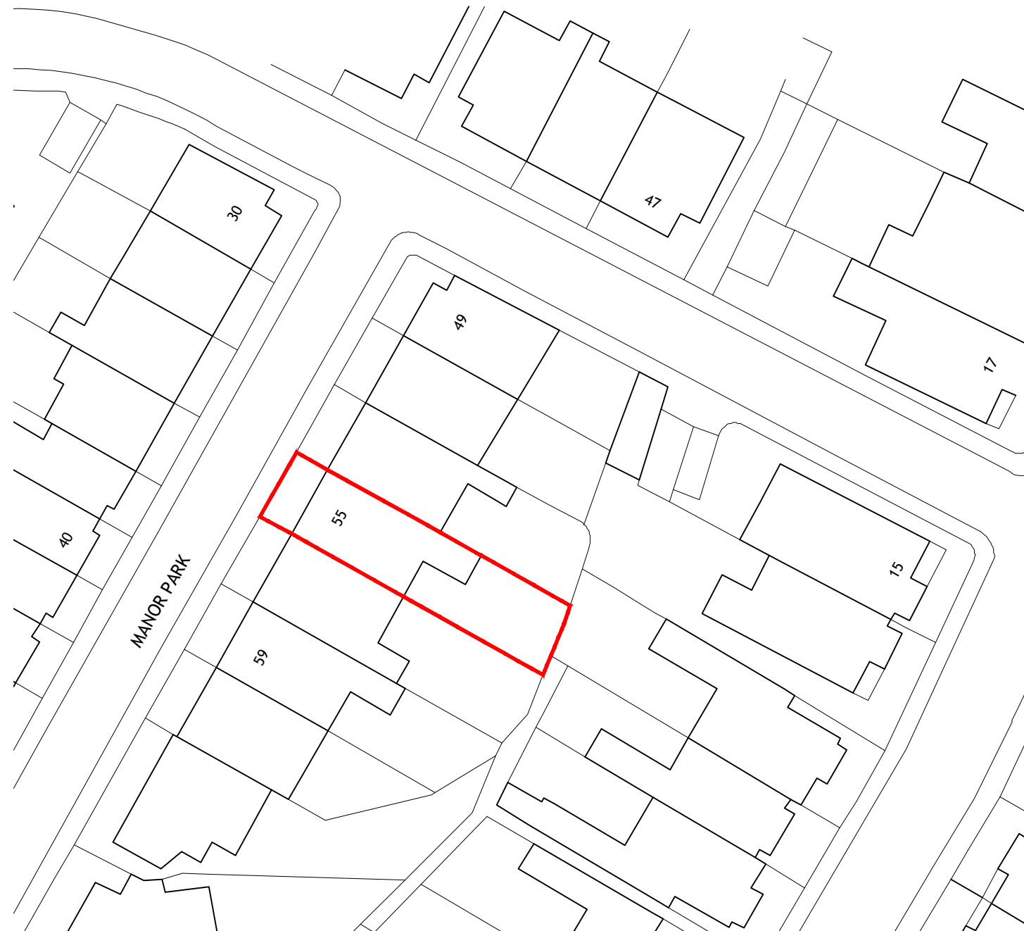
BLOCK PLAN - PROPOSED 1:500