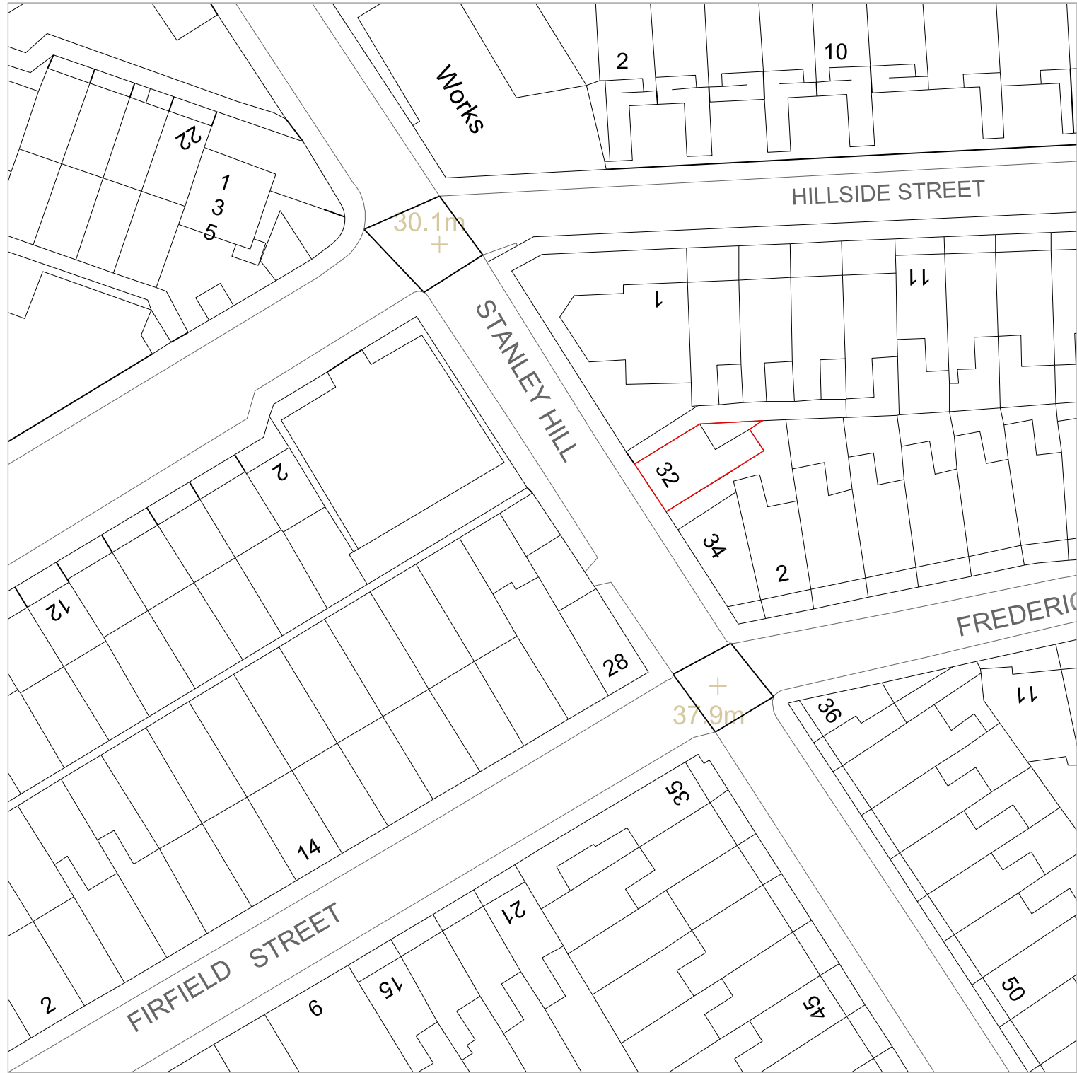
BLOCK PLAN - SCALE 1:500