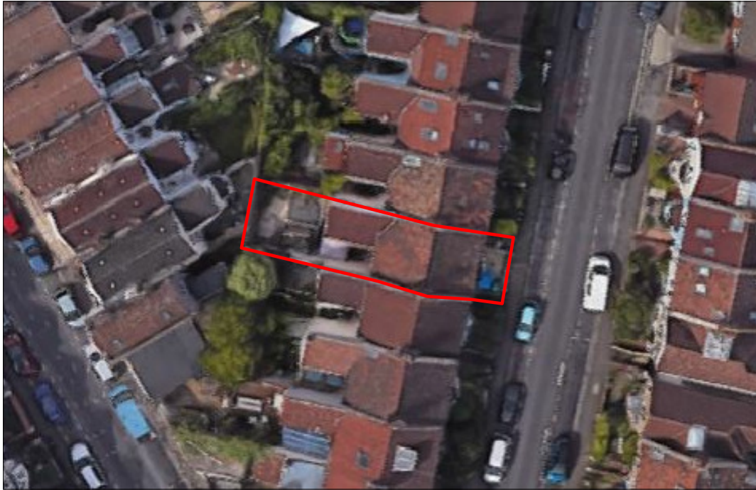
AERIAL VIEW NOT TO SCALE

Space Plus Architectural Design 07973 163 665 Tamsin@space-plus.co.uk www.space-plus.co.uk