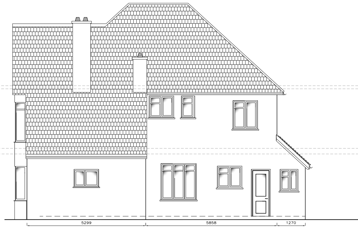
EXISTING SIDE ELEVATION B (1:100)