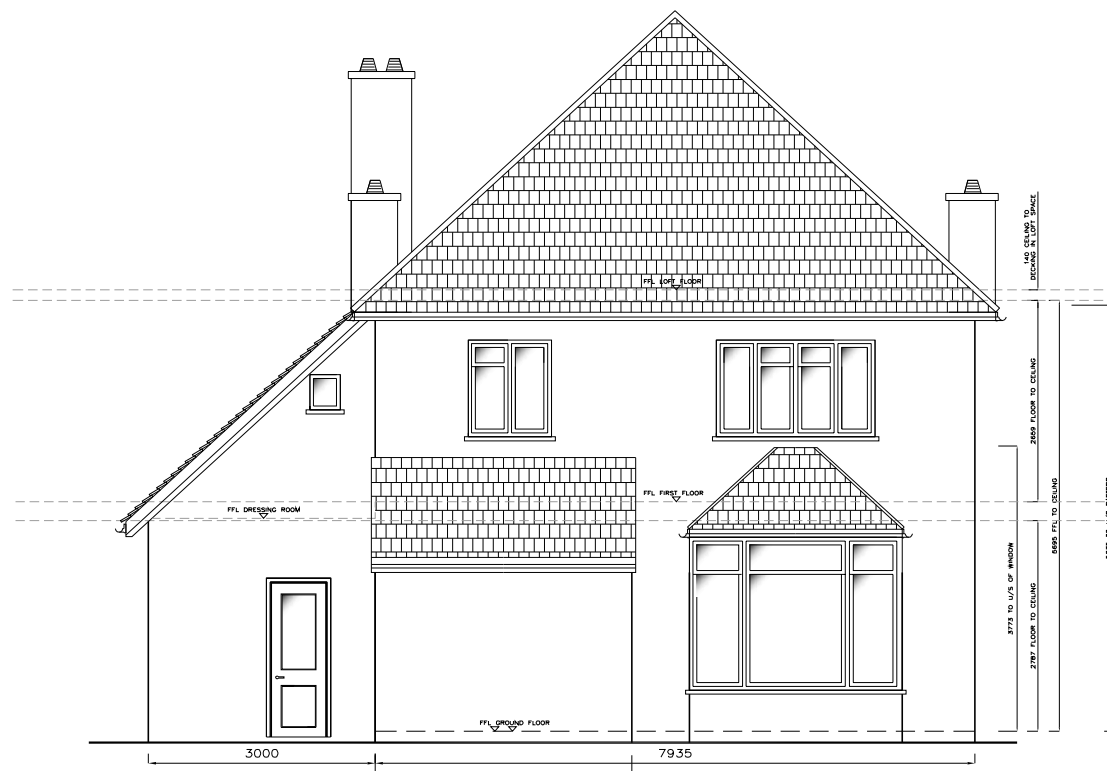
EXISTING REAR ELEVATION A (1:100)