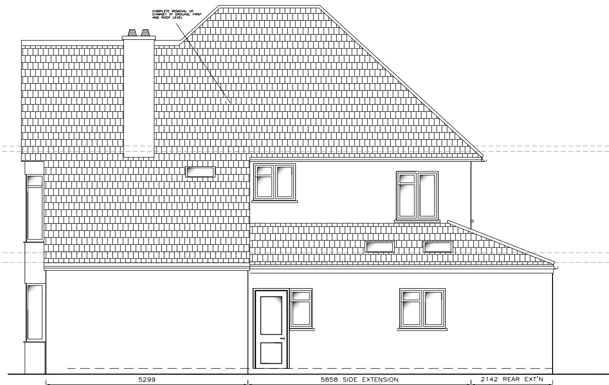
PROPOSED SIDE ELEVATION B (1:100)