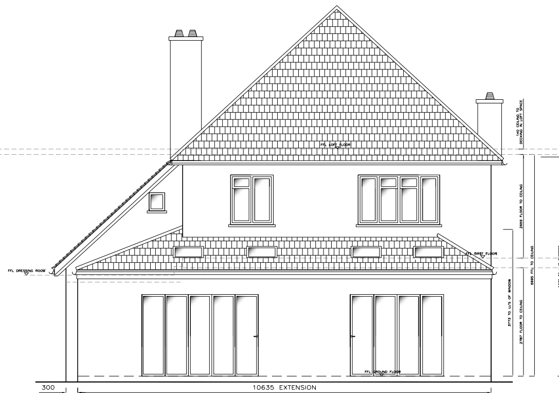
PROPOSED REAR ELEVATION A (1:100)