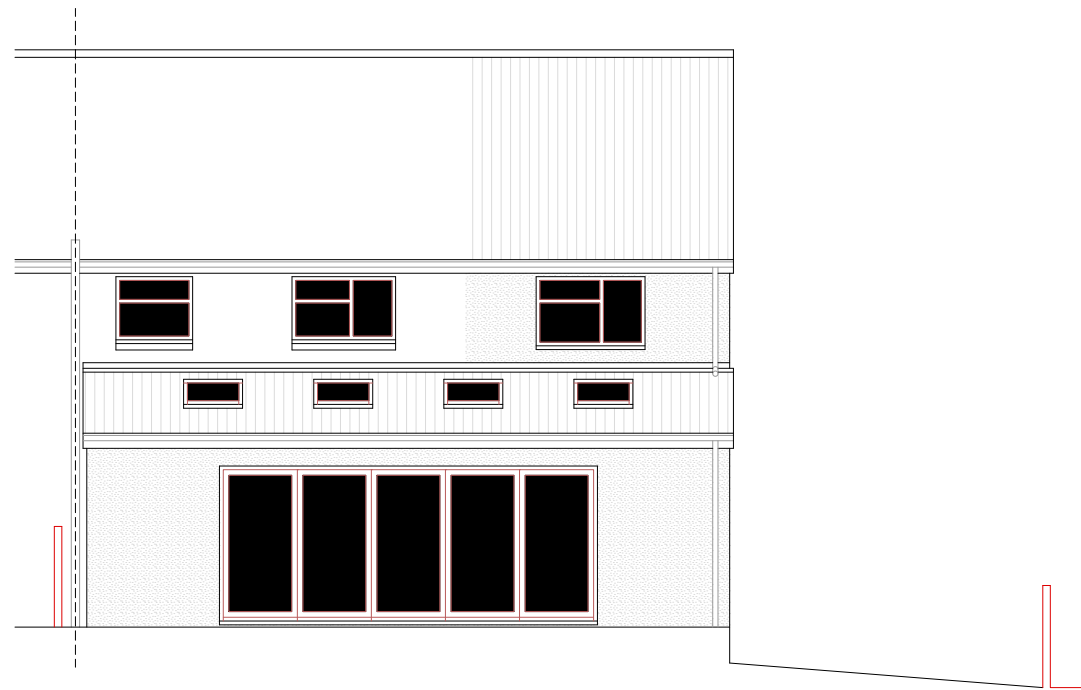
PROPOSED REAR ELEVATION 1:100 @ A3

ROOF TILES TO MATCH EXISTING AND TO SUIT PITCH RENDER FINISH TO MATCH EXISTING WHITE UPVC WINDOWS TO MATCH EXISTING WHITE UPVC FASCIAS TO MATCH EXISTING WHITE UPVC RAINWATER GOODS TO MATCH EXISTING