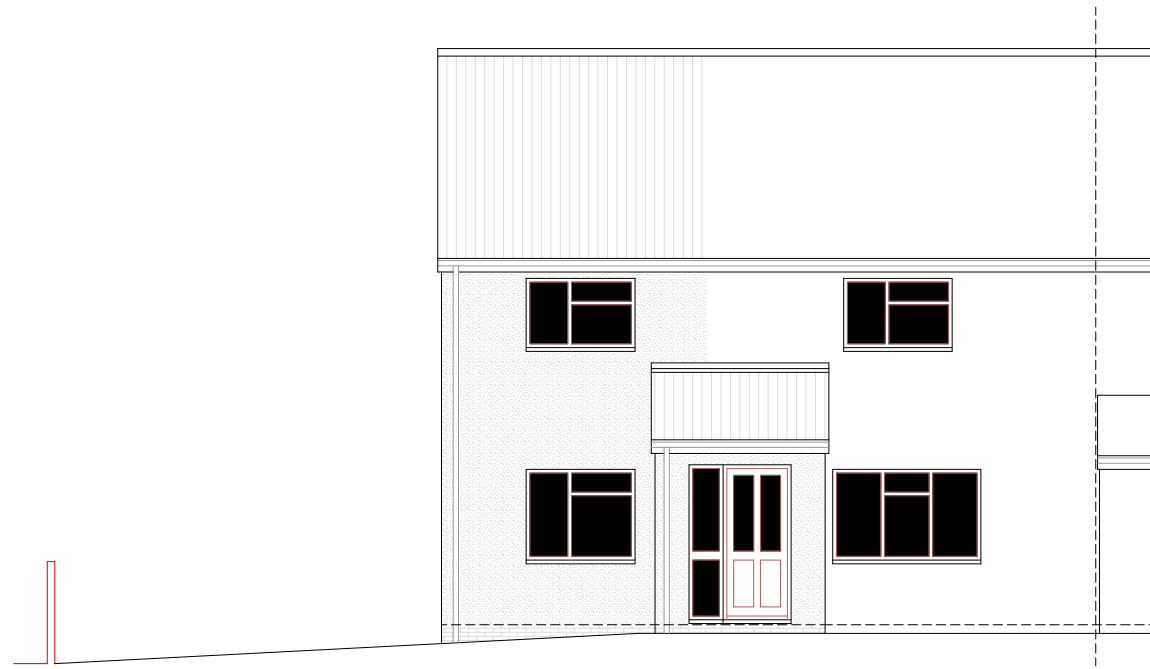
PROPOSED FRONT ELEVATION 1:100 @ A3