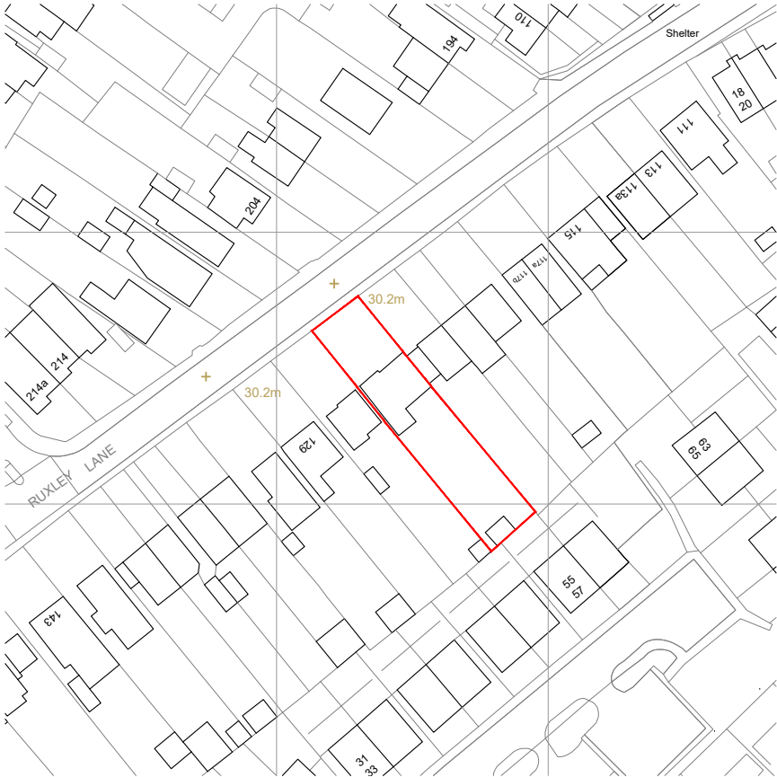
Existing Location Map 0 10 20 30 40 50 1:1250