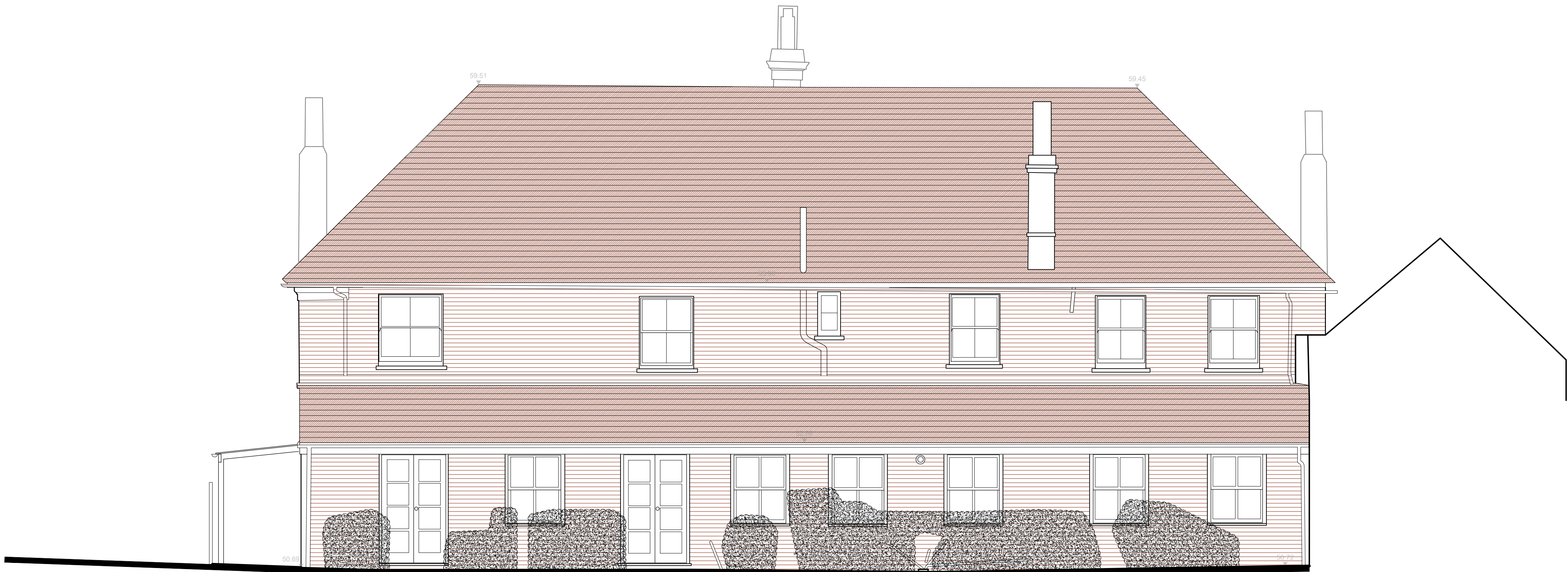
REAR / SOUTH WEST ELEVATION SCALE 1:50

NOTES 1. No dimensions are to be scaled from this drawing except for planning purposes. 2. Contractors must verify all figured dimensions on site before commencing any work or making any stop drawings. 3. This drawing is the sole copyright of Savills and no part may be reproduced without the written consent of the above. 4. Site Location Plans are prepared from the Ordnance Survey Map with the sanction of the Controller of H.M. Stationery Office. Crown Copyright Reserved.