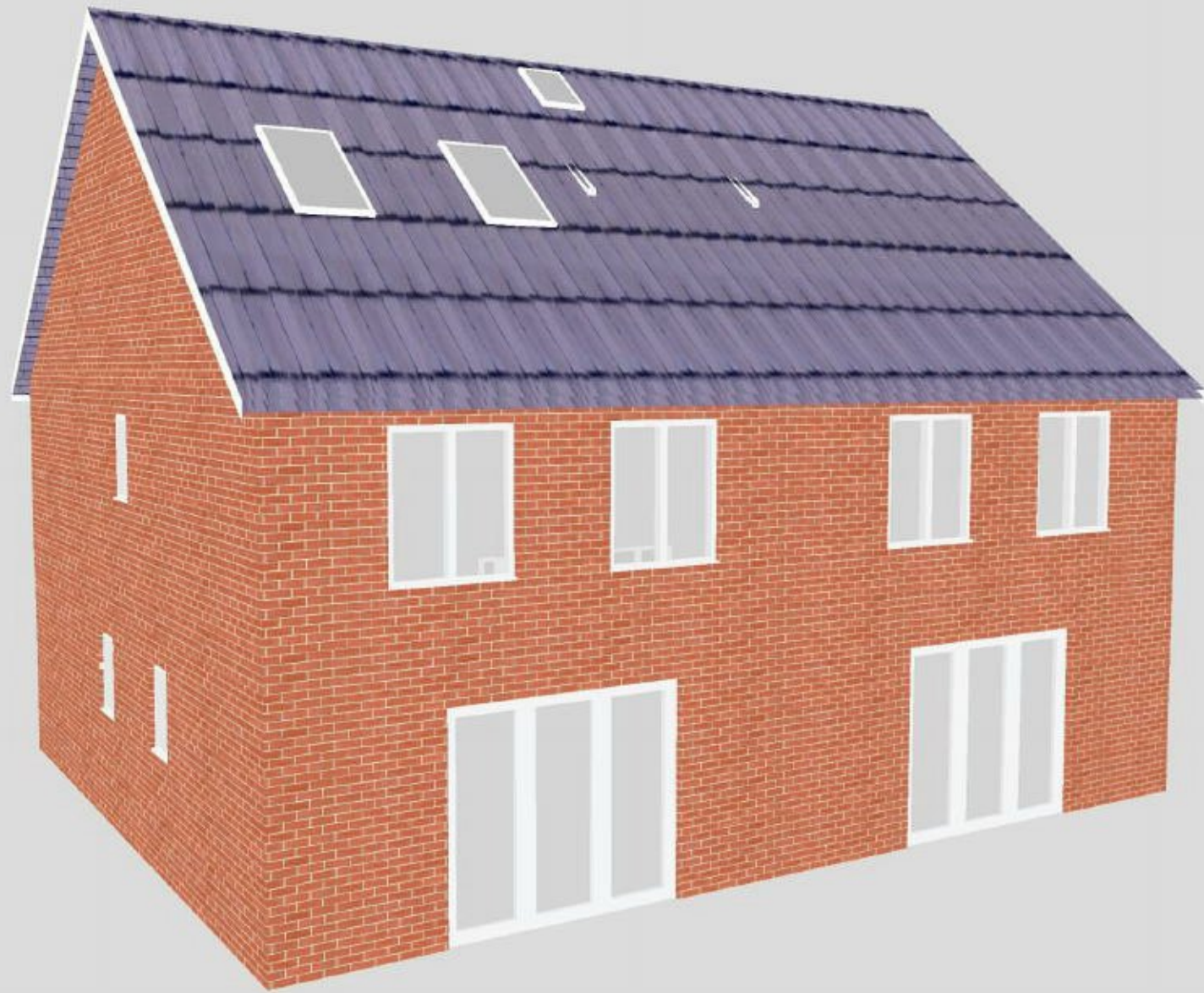
Rear Left side view of the proposed extension