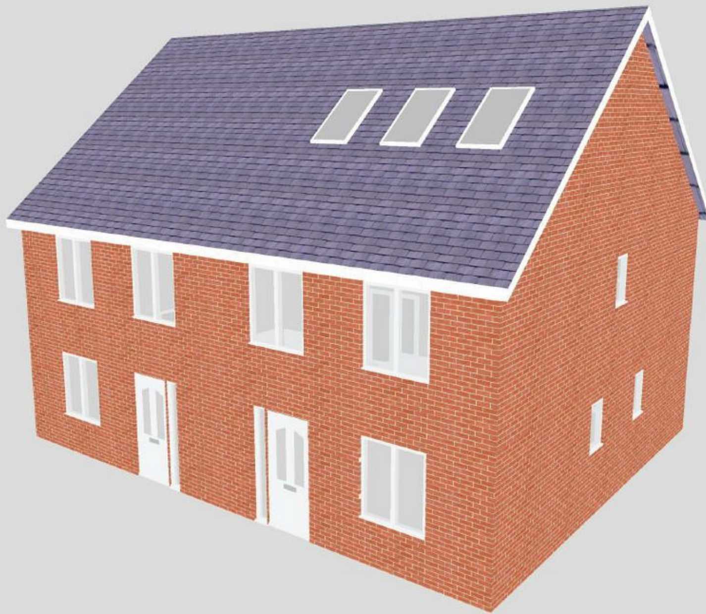
Front right side view of the proposed extension