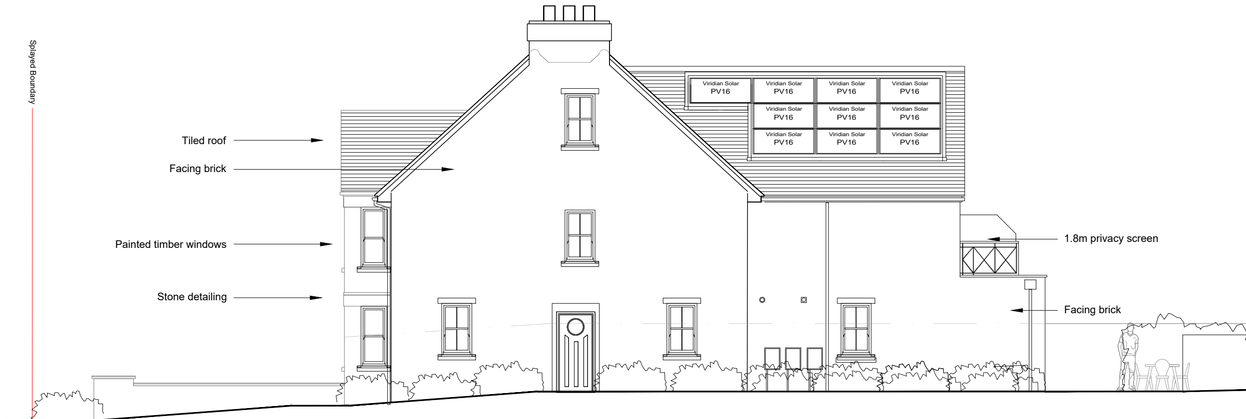
Existing Side Elevation (South)