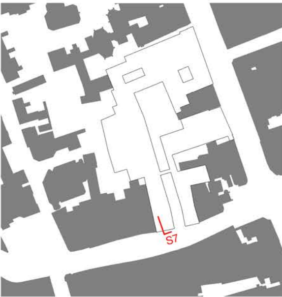
Key Plan 1:2500

Figured dimensions to be followed in preference to those scaled from drawing. All dimensions to be verified on site by the contractors and such dimensions to be their responsibility. Drawing omissions and errors to be reported immediately to the architect.