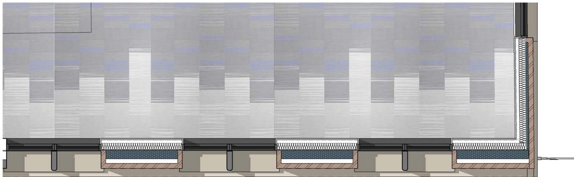
3 First Floor Plan Detail 7 - Labs & Retail 1 : 50