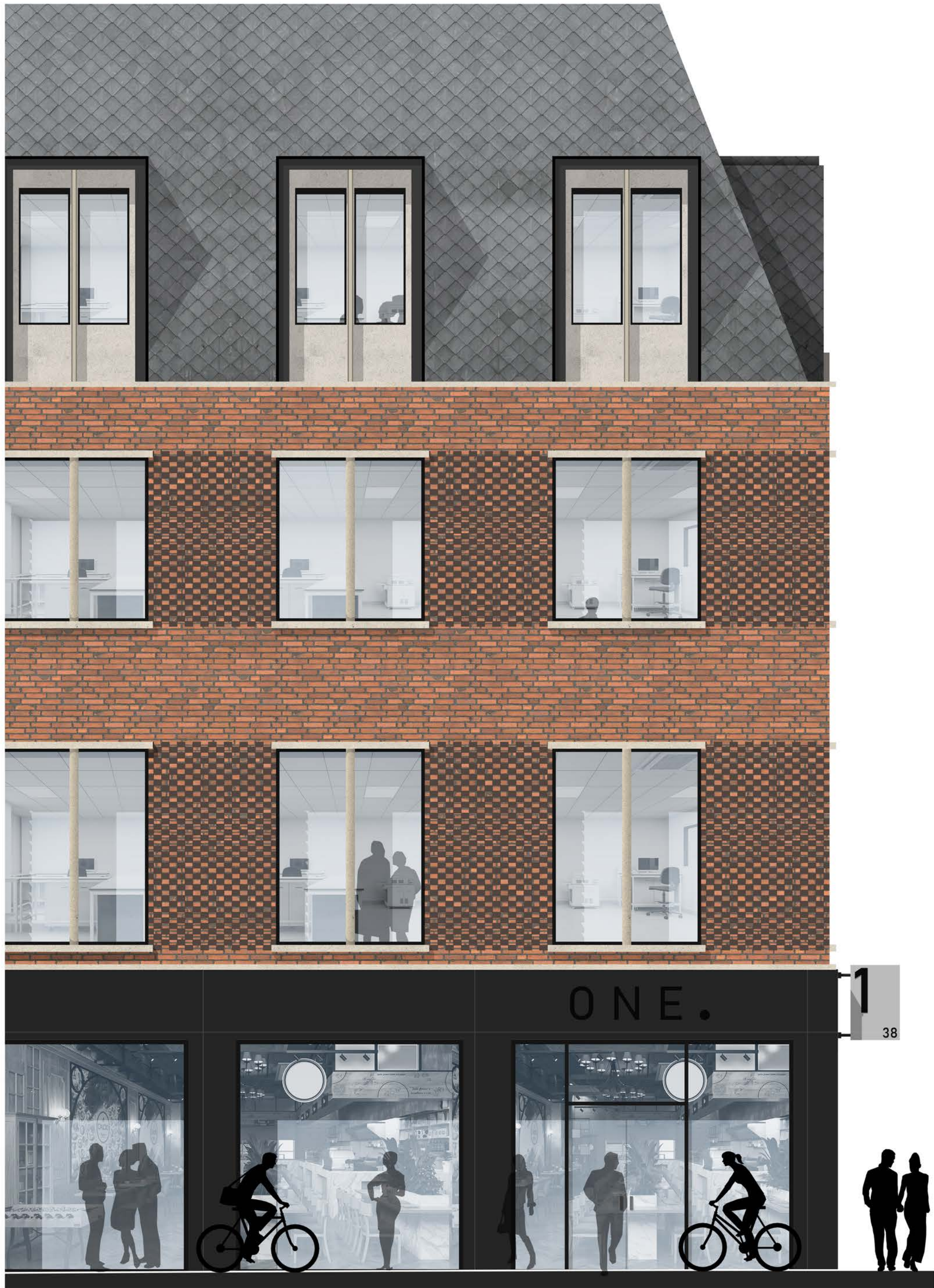
1 Strip Elevation 7 - Labs & Retail 1 : 50