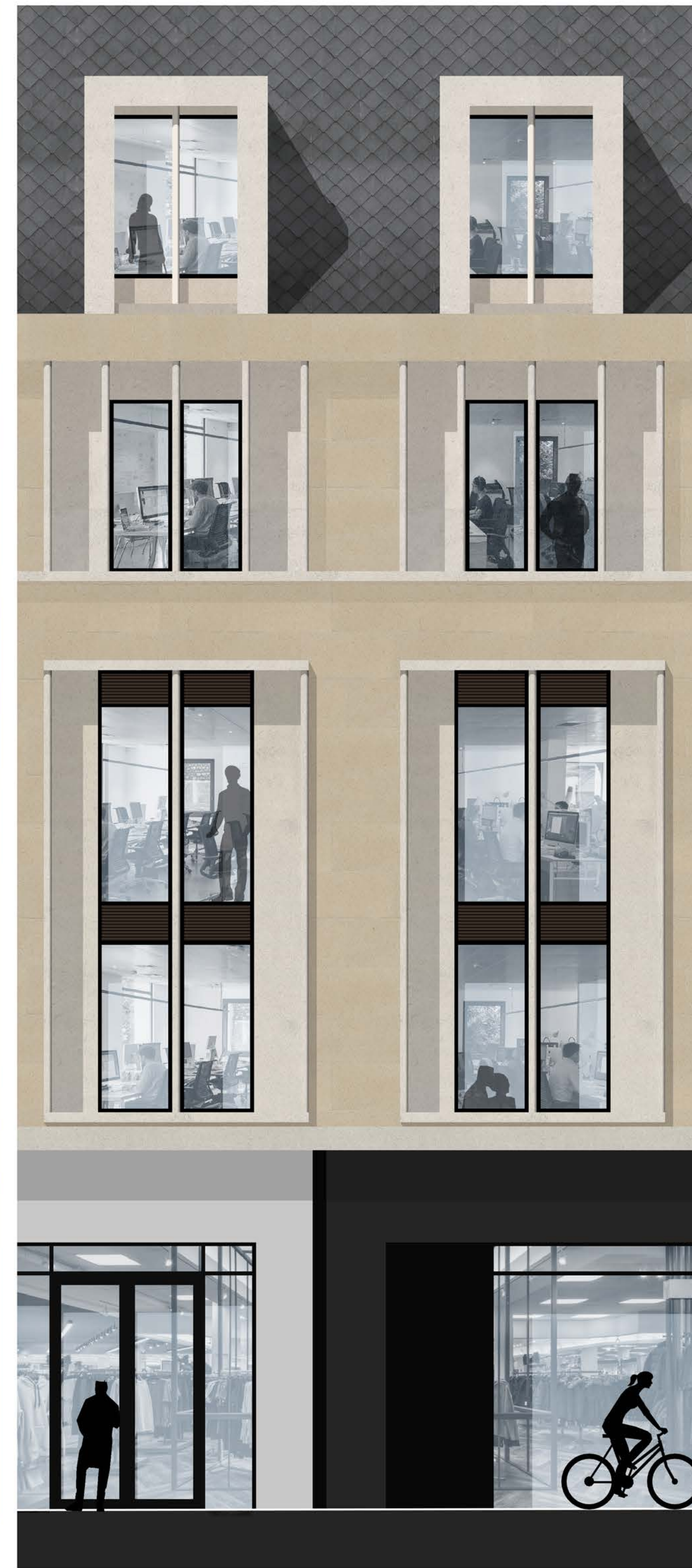
4 Strip Elevation 6 - Conmarket St 1 : 50