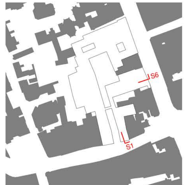
Key Plan 1:2500

Figured dimensions to be followed in preference to those scaled from drawing. All dimensions to be verified on site by the contractors and such dimensions to be their responsibility. Drawing omissions and errors to be reported immediately to the architect.