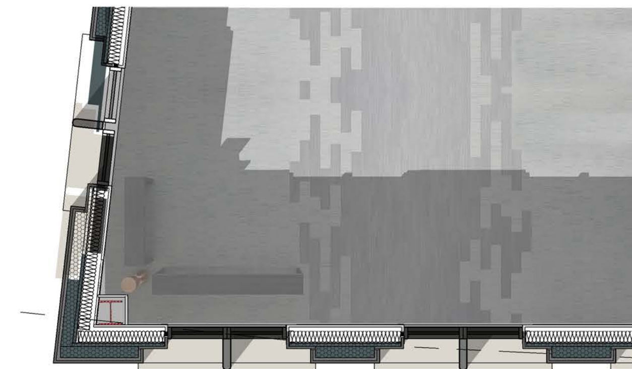
5 First Floor Plan Detail - Queen St 1 : 50