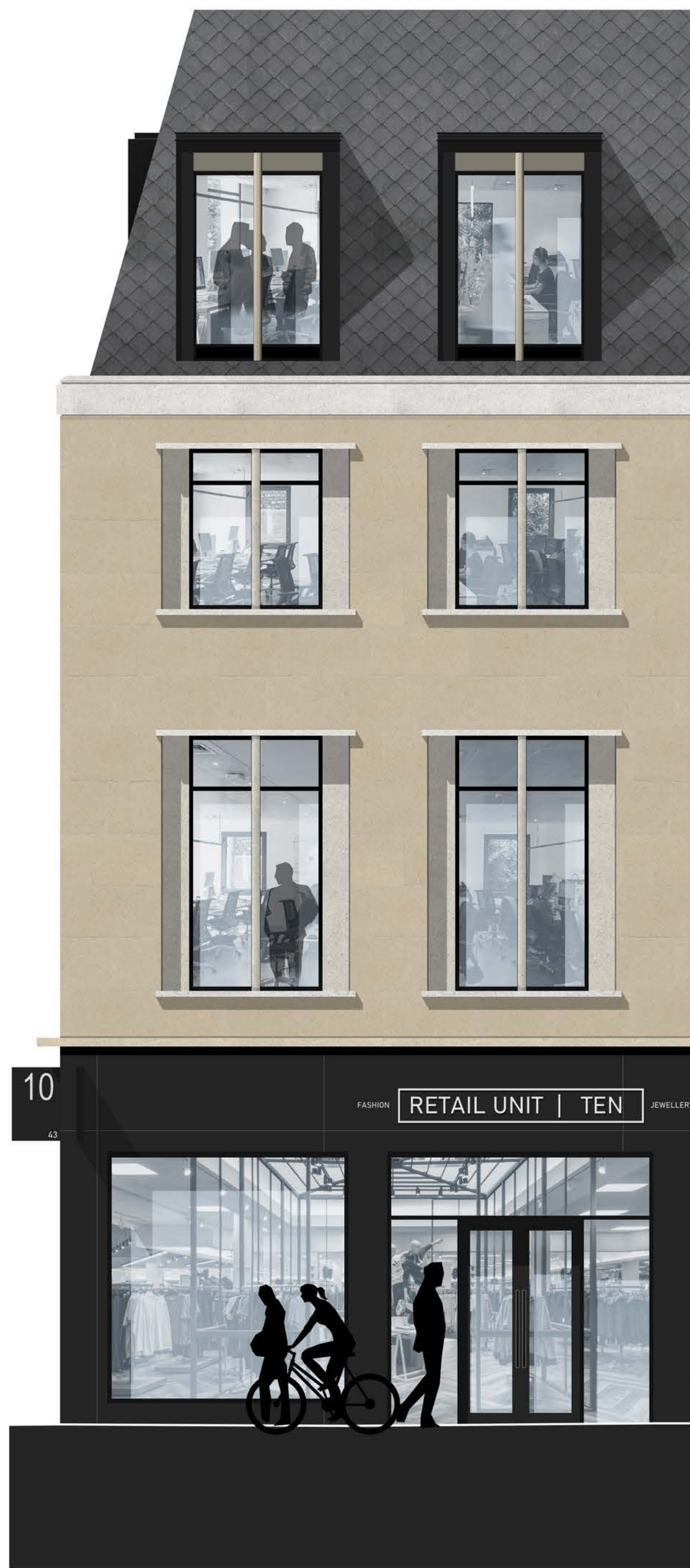
2 Strip Elevation 1 - Queen St 1 : 50