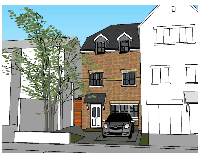
STREET VIEW FROM THE FRONT