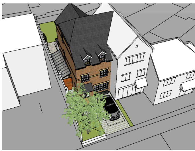
AERIAL VIEW FROM THE FRONT