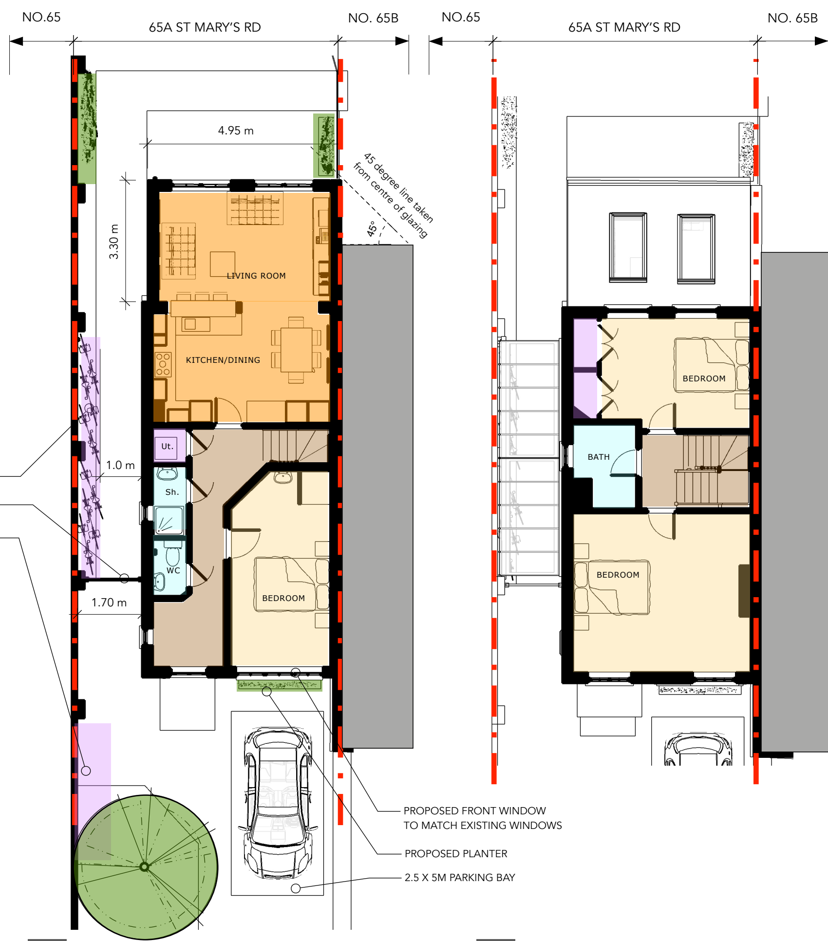
1 PROPOSED GF PLAN (scale 1:100 @A3)