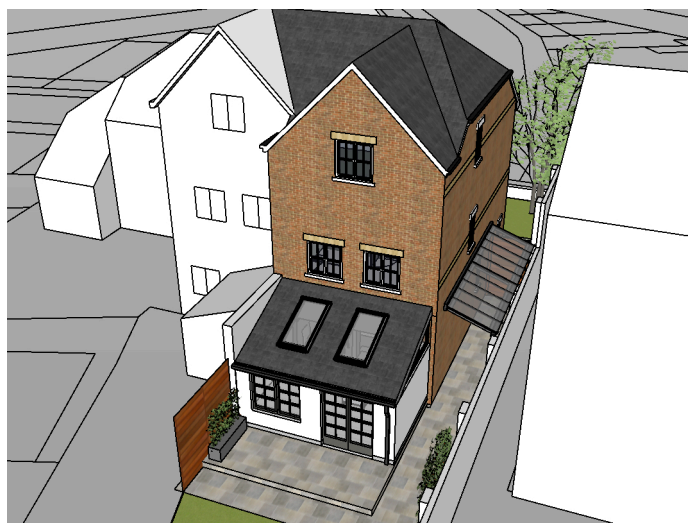
AERIAL VIEW FROM THE BACK