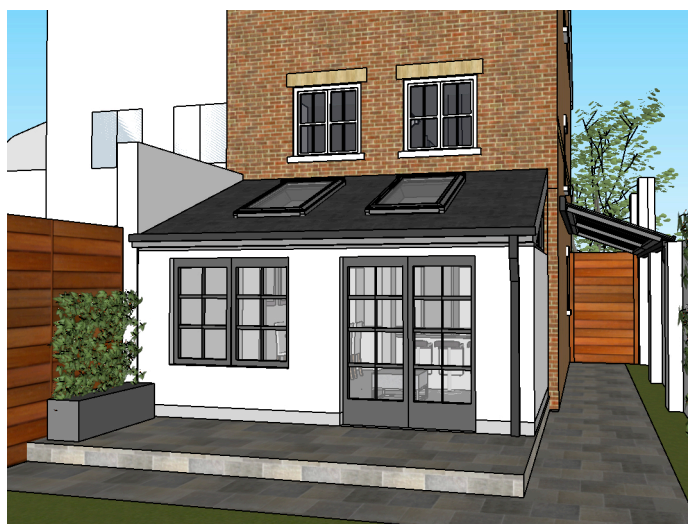
PERSPECTIVE VIEW OF THE PROPOSED EXTENSION