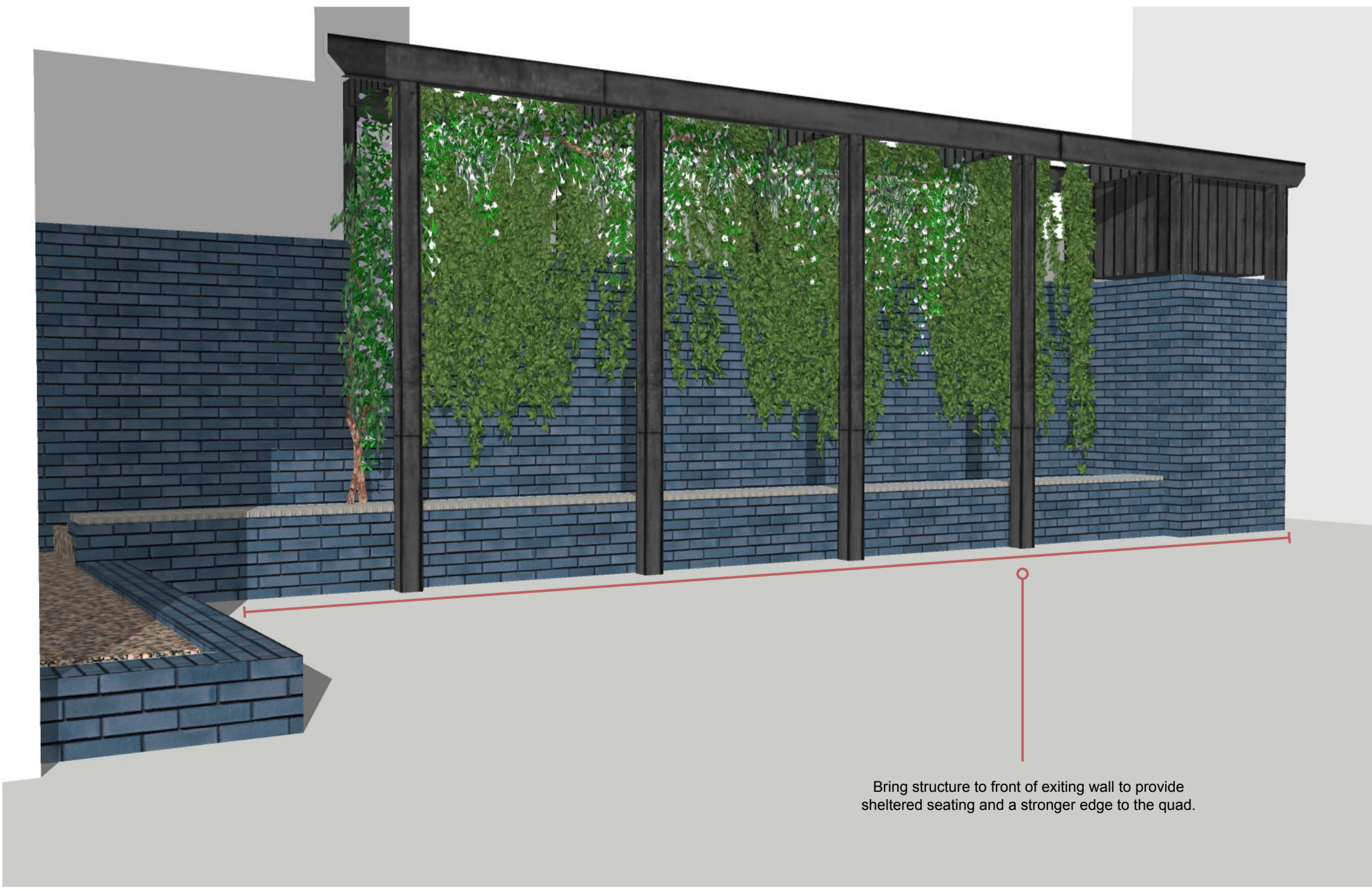
SMALL QUAD - TRELLIS ILLUSTRATION NTS

/ 24.11.20 Planning submission Rev Date Description VM Initials PROJECT Trinity College Proposed Small Quad TITLE: Small Quad - Proposed Floor Plan and 3D renderings SCALE: 1:100@A1 DATE: November 2020 DRAWING No: 5446/76 DRAWN BY: vm