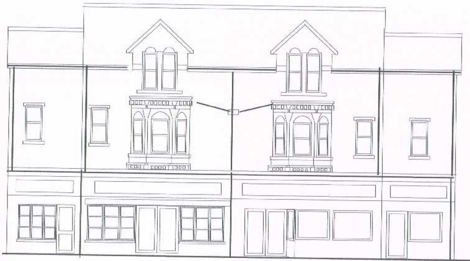
Existing Front Elev