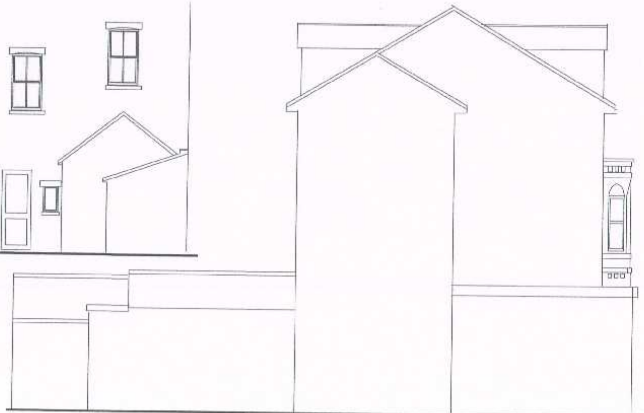
Existing Side Elev