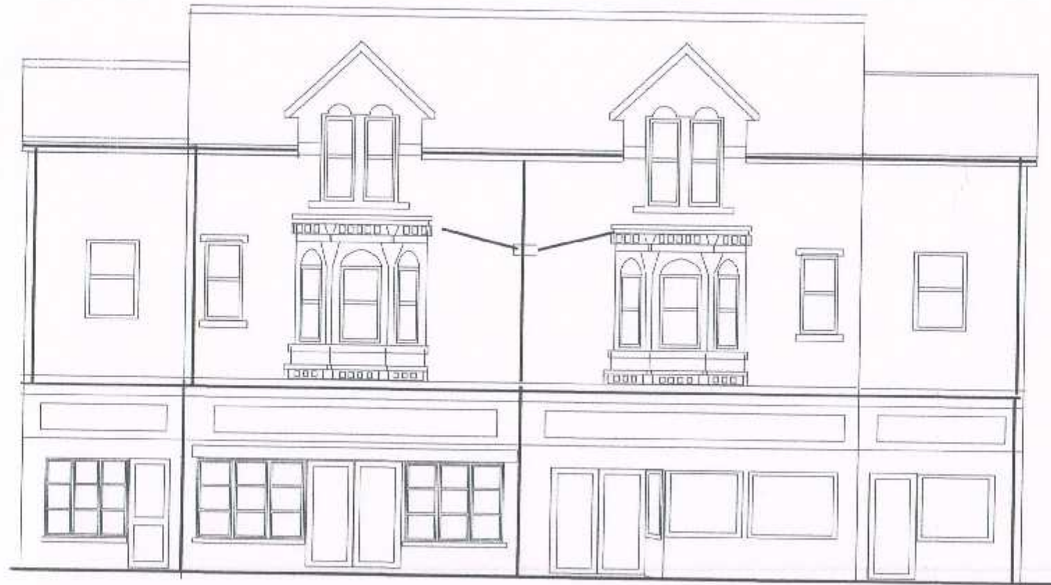
Proposed Front Elev Retrospective