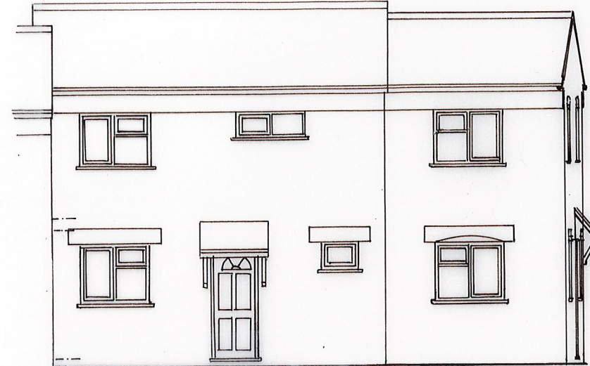
WEST ELEVATION (FRONT)