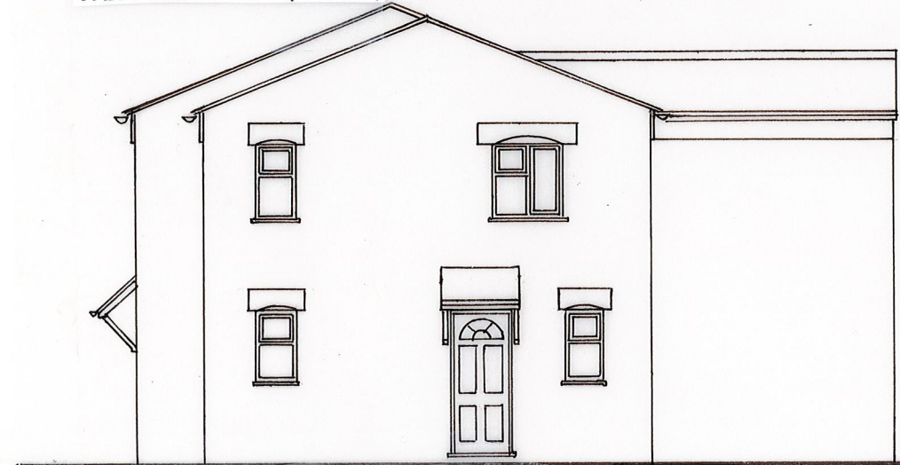
SOUTH ELEVATION (MAIN ROAD)