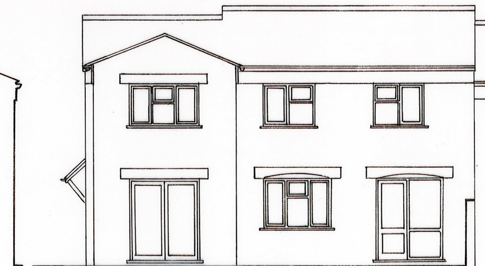
EAST ELEVATION (REAR)