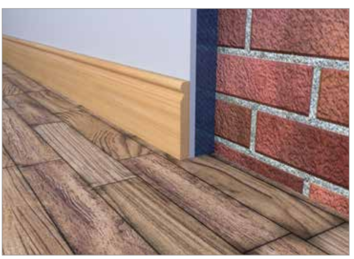
Spacetherm Multi skirting detail

Where an internal partition abuts an external wall with Spacetherm Multi lining, ideally Spacetherm Multi should be returned onto the partition or alternatively stopped at the junction.