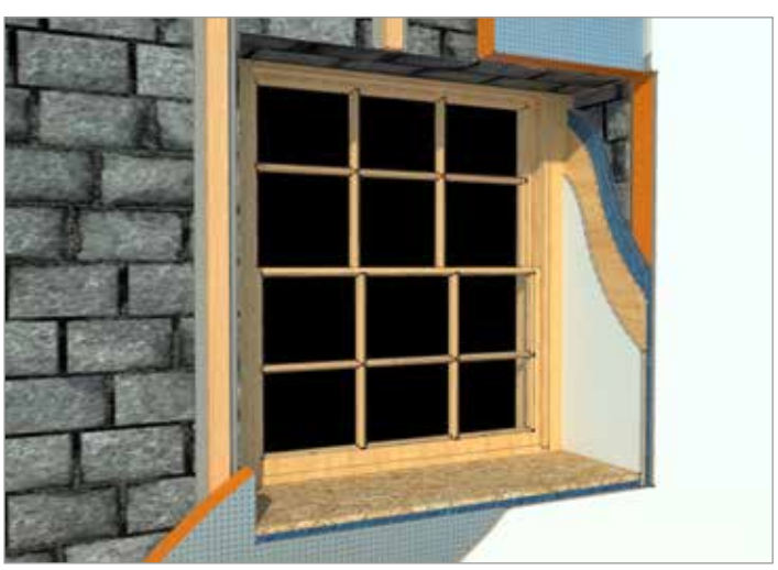
Image showing Spacetherm WRB applied internally to a reveal on an existing external wall structure.