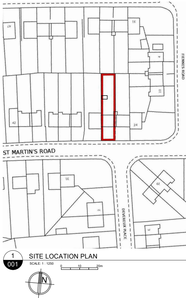
1 SITE LOCATION PLAN