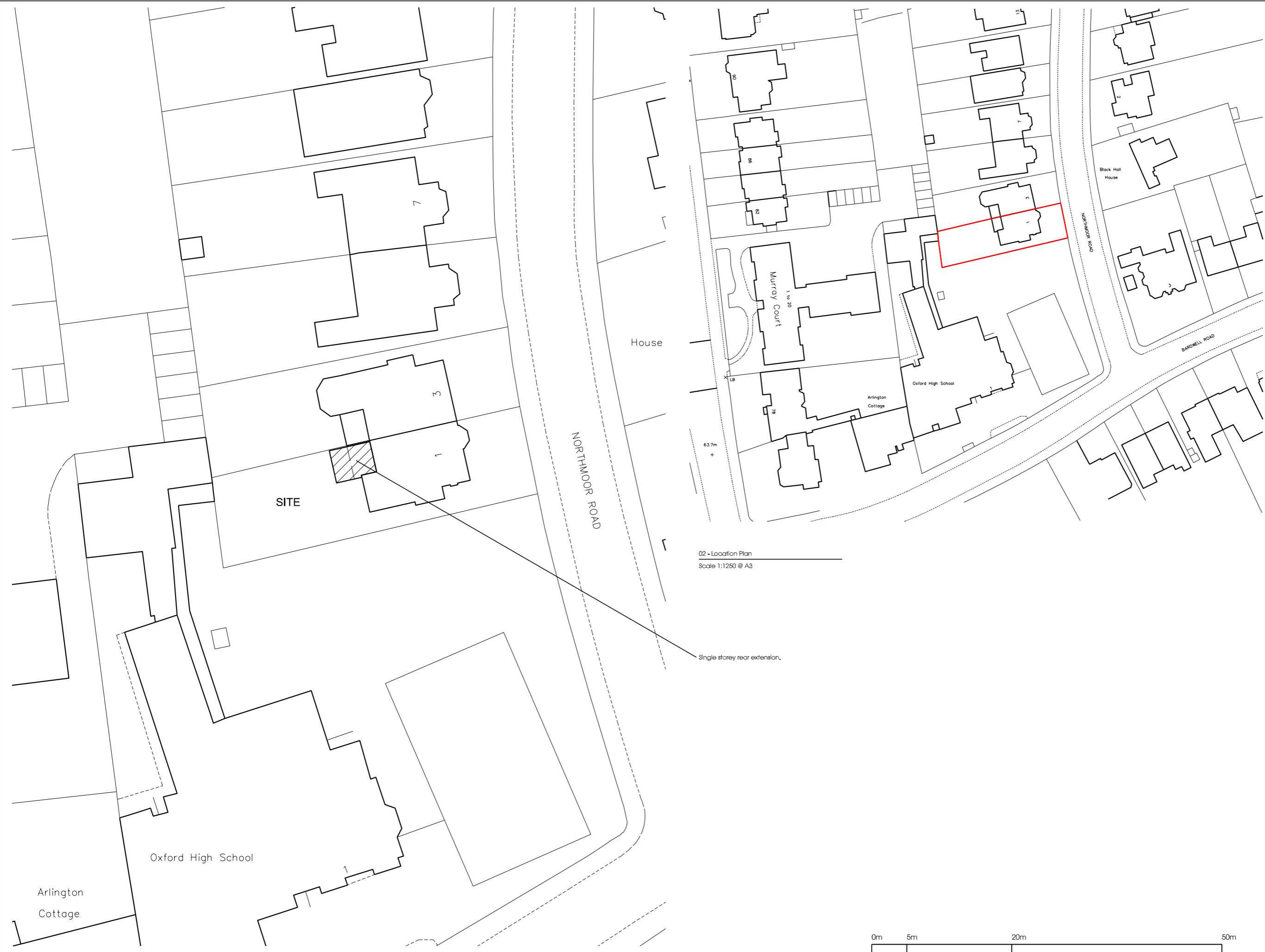
02 - Location Plan Scale 1:1250 @ A3