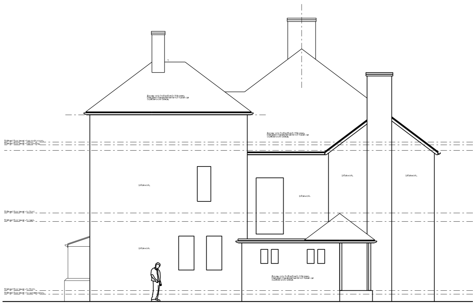
02 - Existing Side Elevation Scale 1:100 @ A3