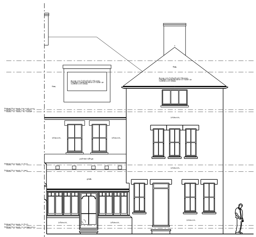
01 - Existing Rear Elevation Scale 1:100 @ A3