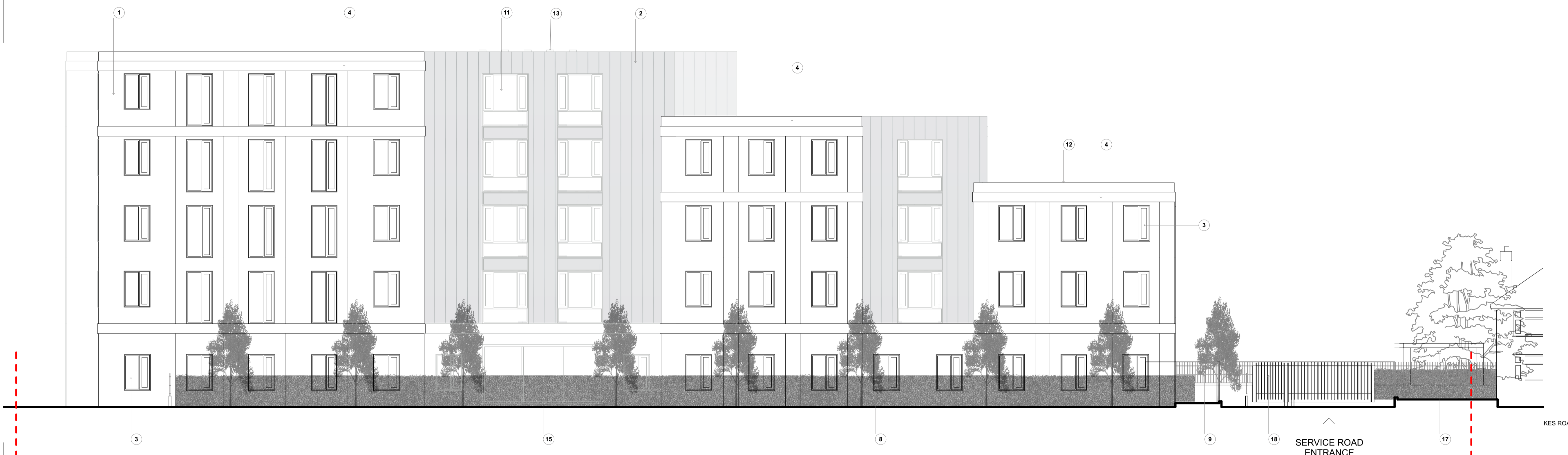
South West Elevation (St Luke's Road)